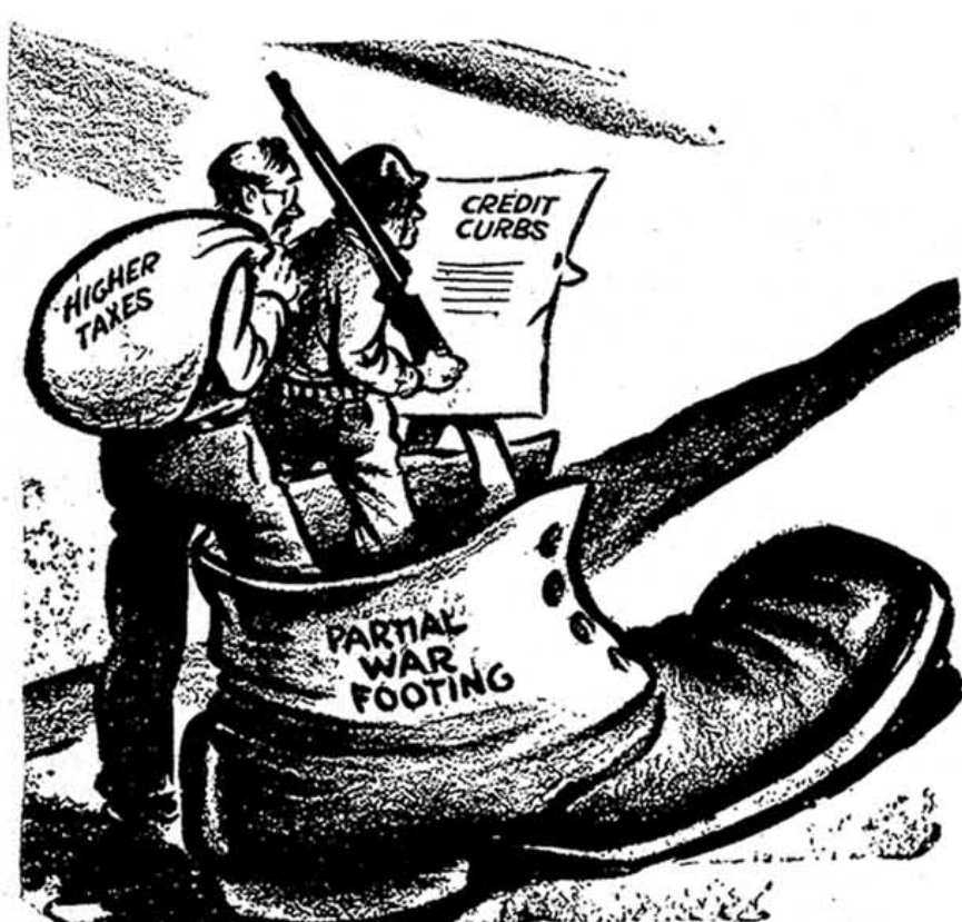
Bishop in St. Louis Post-Dispatch "Forward, March!"

A showdown on economic mobilization shaped up. Congressmen argued over: 1) whether a step-by-step defense effort would be enough; 2) a plea by Bernard Baruch for all-out price, wage, rent and rationing controls.