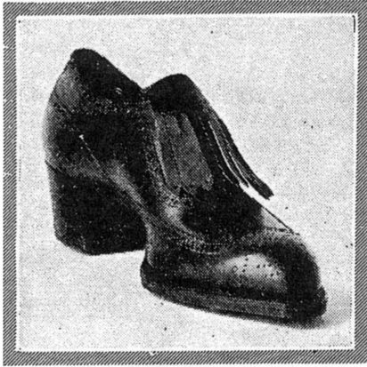
Scotch oxford golf shoe with Lorne tongue and full brogueing. The price is $26 a pair