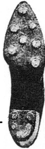
Plugged sole of Scotch oxford golf shoe, for firm stance

A LTHOUGH it has nothing to do with riding, I have illustrated in this issue, an excellent type of shoe for golf. This is a Scotch oxford with a Lorne tongue and a scarfe sole set with plugs, of course, which give a very firm grip on the ground. It is vitally important to have a firm stance and to this the shoe — properly designed — contributes very greatly. A rather interesting high golf shoe now on the market, which I shall illustrate in a later issue, incorporates a special feature at the instep which permits the player to turn very freely without moving his foot. This is a feature which will be appreciated by those who like to wear golf shoes of ankle height but who dislike the stiffness at the ankle which is frequently found in them. Perfect freedom of movement during the course of the swing contributes much to the success of one's game.