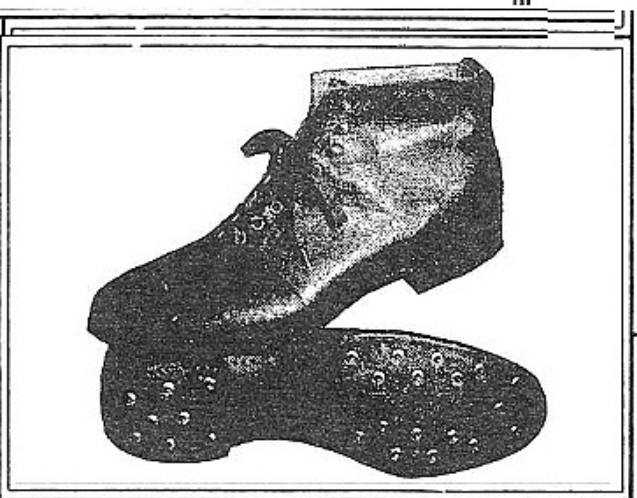
High cut golf shoe of tan calf. Sole and heel nail-studded. Reinforced over instep, $7.50