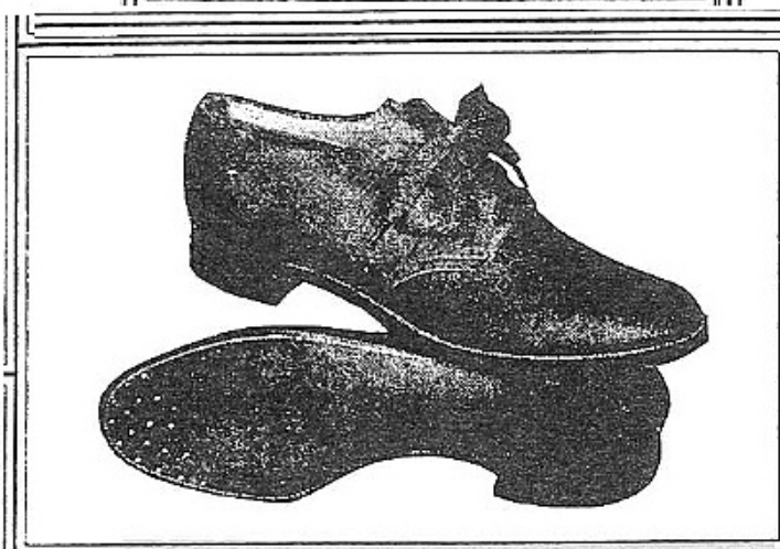
Golf Oxfords of tan calf, Blucher cut. Soft and comfortable yet strong and durable, $5.50