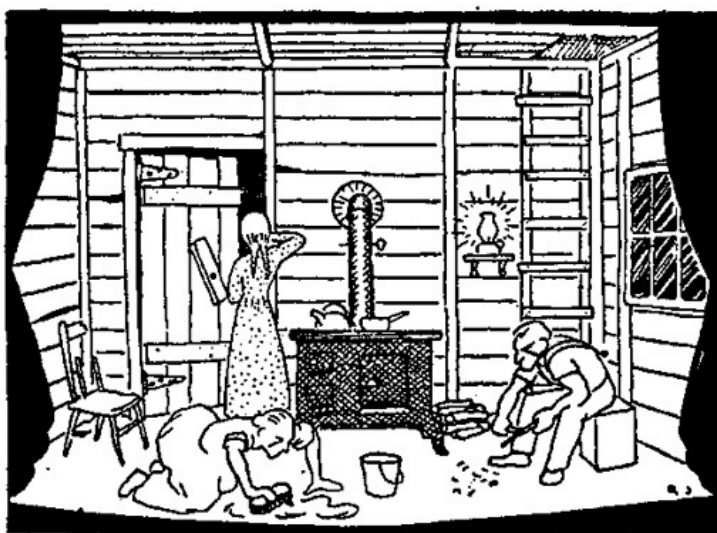
IN THE "ART" THEATRE.