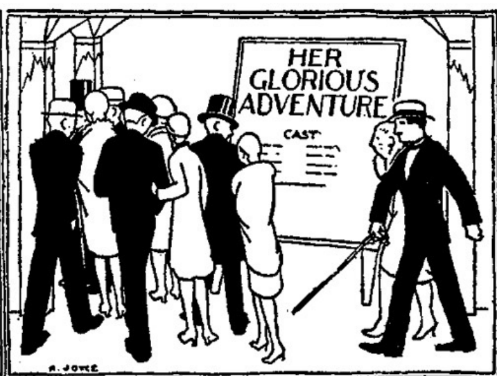
NOW THEY HURRY IN.