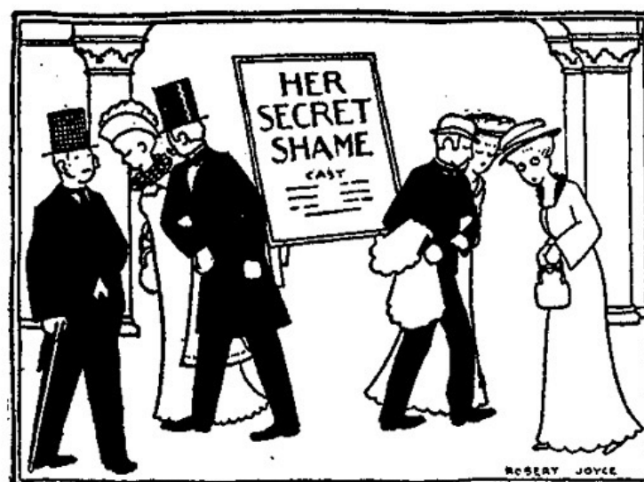
ONCE THEY HURRIED BY.