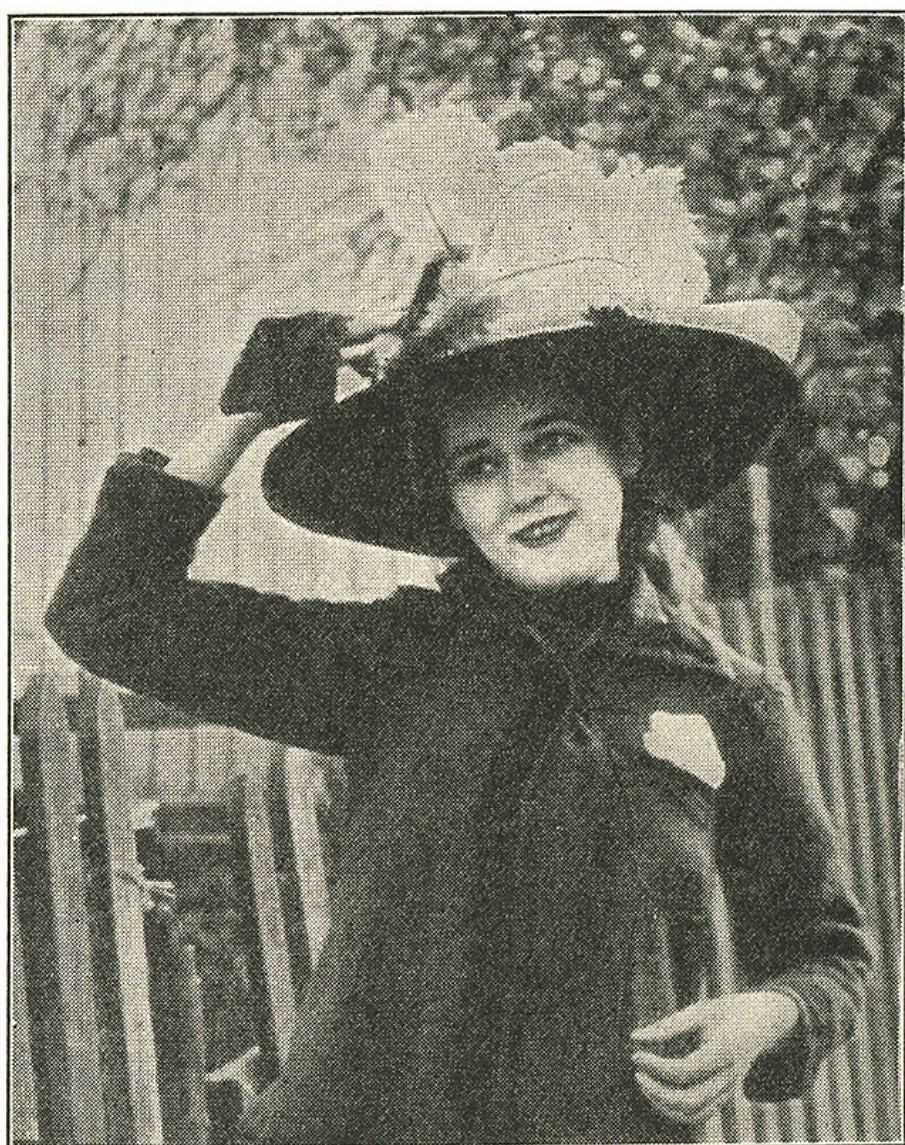
Mary Pickford in an early movie.

In 1913 moving-picture theatres were multiplying rapidly all over the country. A survey showed investment in American film theatres totalled roughly $1,000,000,000. Moving-pictures were accompanied by illustrated songs to the accompaniment of a piano and a perfunctory travel lecture. In May, 1913, the Theatre Magazine stated that "the popularity of the moving picture as a form of public amusement, far from being on the wane, is increasing by feverish leaps and bounds."