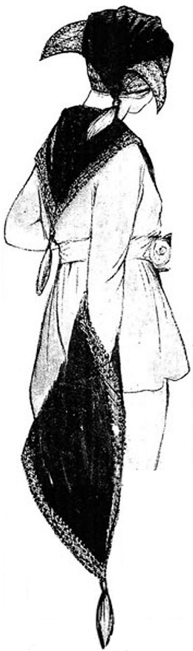
Carlier fashions this "set"—one of the season's successes—of black panne velvet edged with jet and tasseled with steel.

Over and over again Poiret uses black and white in various combinations in his latest creations. One dress in black and white shows a black satin foundation