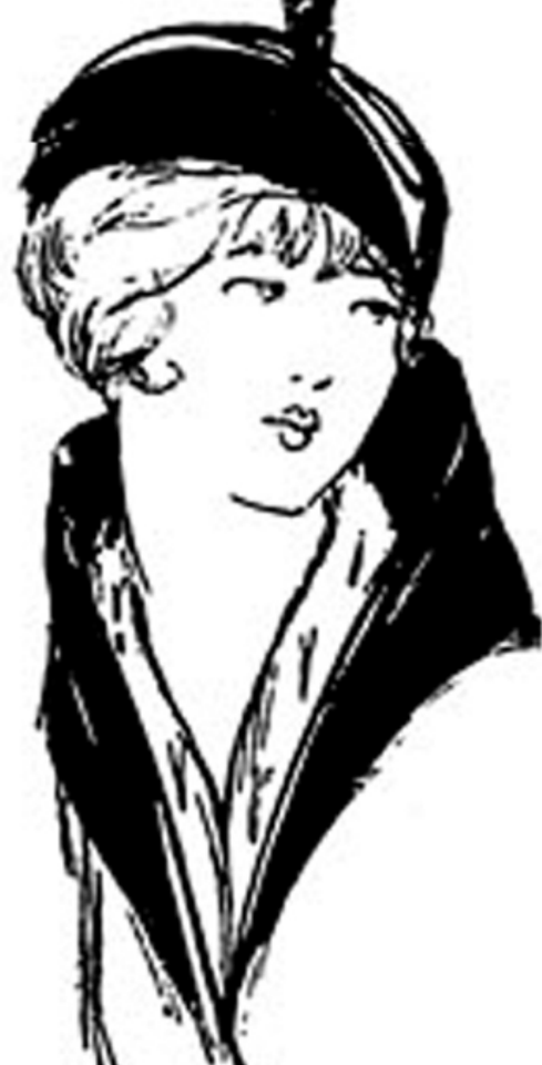
A Scotch cap of black velvet suitable to wear with a plaid walking suit

French traditions clearly shown in the evolution of ideas originated a couple of centuries ago.