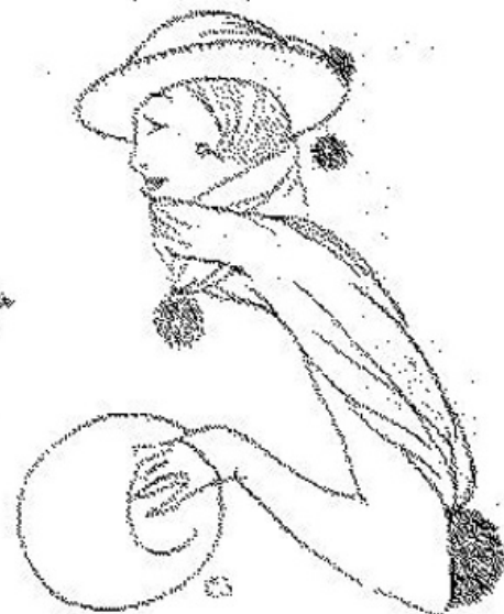
A Wedgwood green jersey cloth scarf has a chiffon lining and repeats in repeat color. The hat, to match, is buttonholed with wavyed. Lucie Hamar model