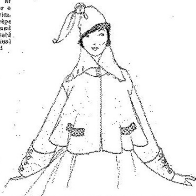
Sports in the country shall shortly entertain this gay new type of jacket and cap made of Jodre blue jersey cloth and designed by Lucie Hamar. The hat is knotted at the tip of the crown, tapering to a pointed end and its brim is lined with rough sea grass. The lower coat is simply provided with cuffs and collar, its only foreign trimming being two little pocket tabs of crease. All models except one at upper left imported by Clairville, Inc.