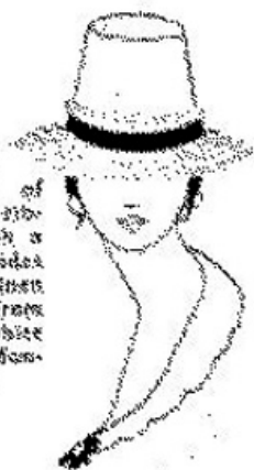
A single band of dark blue moiré ribbon fastened with a steel buckle divided on old blue linen with a crown trim of white cotton fringe. Mon-jeret model