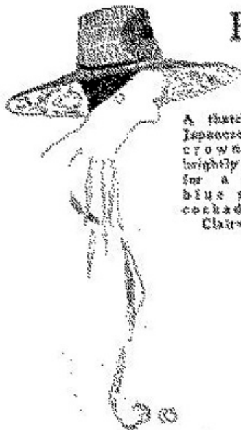
A ruffled roof of Japanese straw for a crown and trim. brightly figured crepe for a facing and blue satin bristled cascade. Original. Clairville model