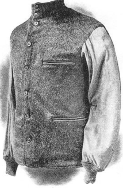
Trapshooter's coat of green zibeline with sleeves of gray reindeer and sweater neck and wrists. Price, $17.50