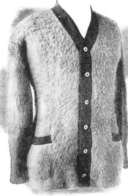
Warm but light sweater of brushed wool with contrasting facing and pocket facings that match. Price, $18.00