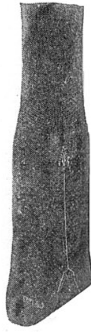
Socks of light wool are very suitable for wear aboard ship. The sort illustrated is of Scotch knitted wool in a flat weave in tones of blue and gold with a clock of harmonizing shade. $1.00 a pair