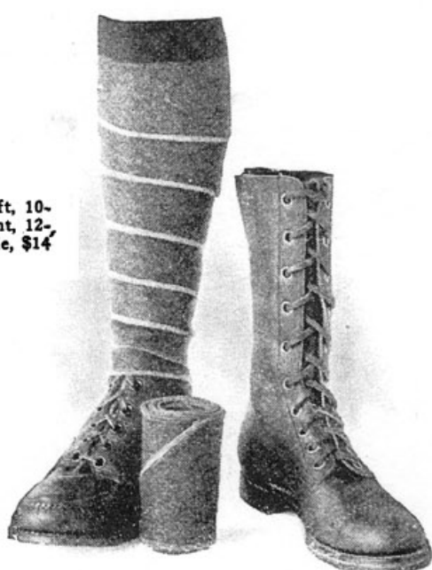
Spiral wool puttees, $3.00. On the left, 10-inch cruiser boot, $10.00. On the right, 12-inch woodsman's boot of oiled cowhide, $14