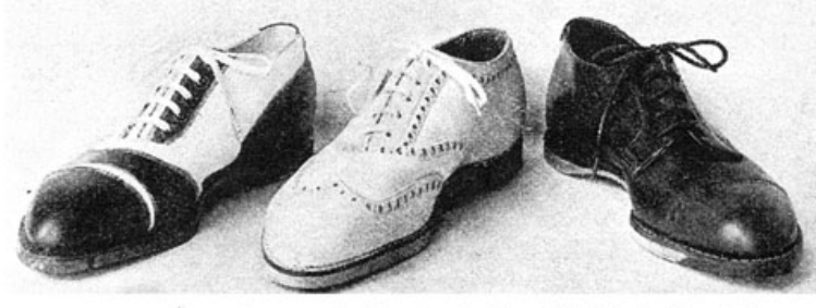
Yachting shoes; of white buckskin with black trim and black rubber sole, $10.00; all white buckskin with three-quarter wing tip, $10.00; tan Russia calf with red rubber sole and with a leather underlay at the toe, $8.50