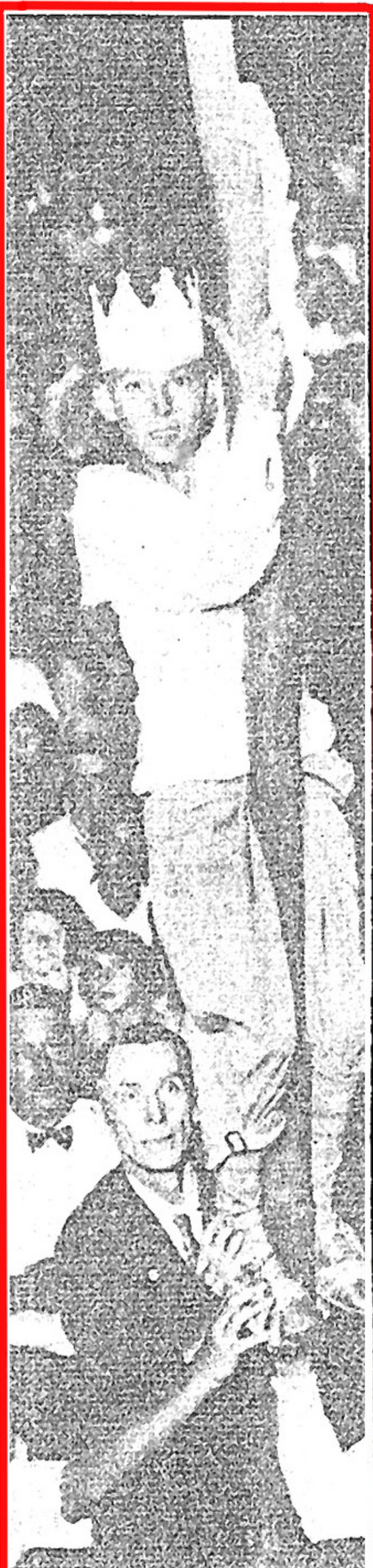
HAIL TO THE CHIEF!