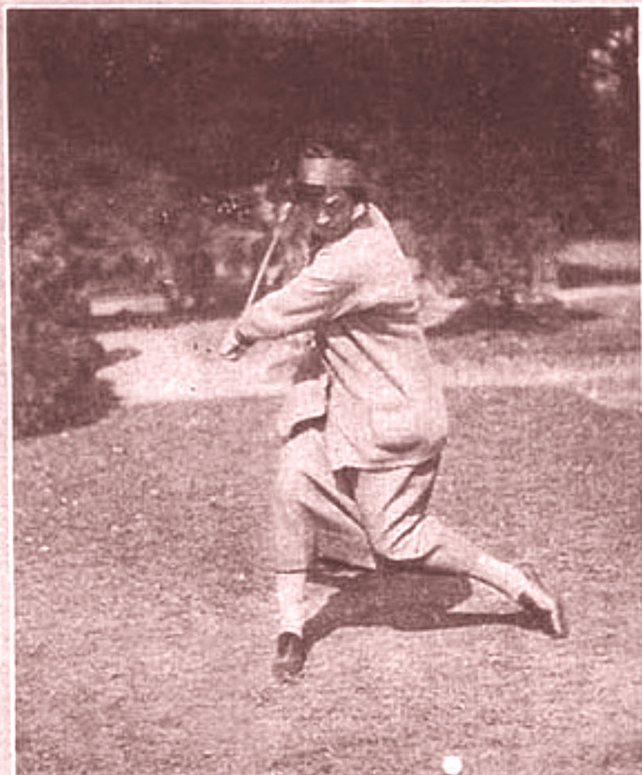
HALF WAY DOWN

The head has not moved and the left arm is still singularly straight