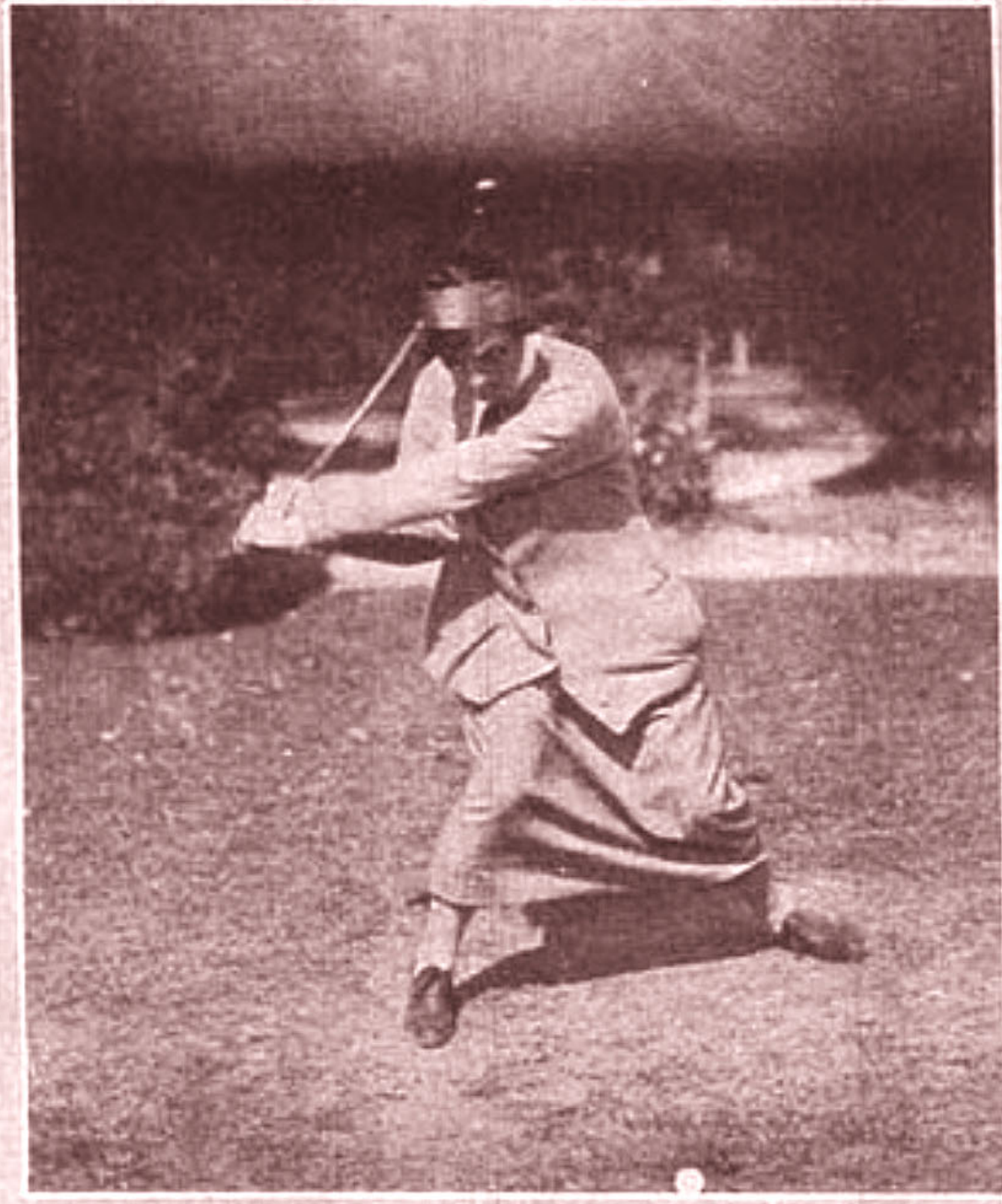
HALF WAY UP

Note the straight left arm and the beginning of the somewhat low crouch