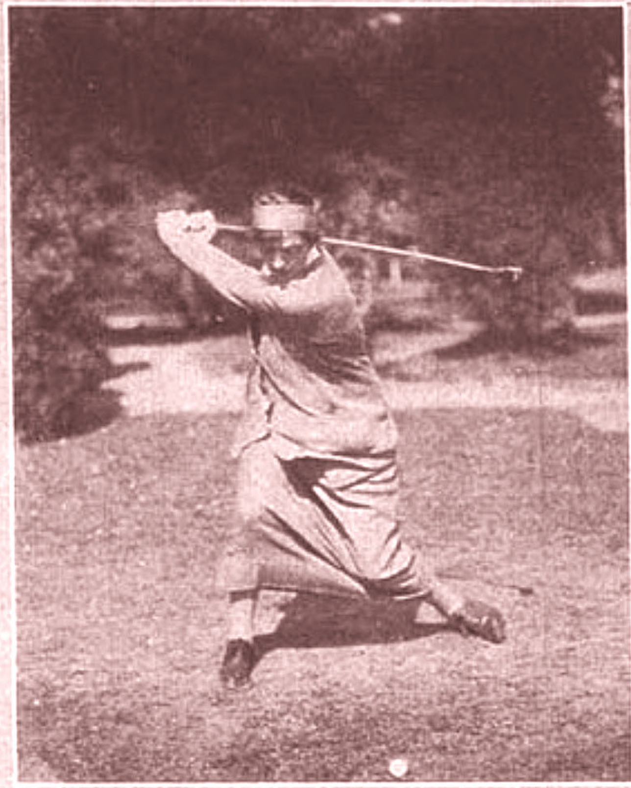
AT THE TOP

Note the straight left arm and the beginning of the somewhat low crouch