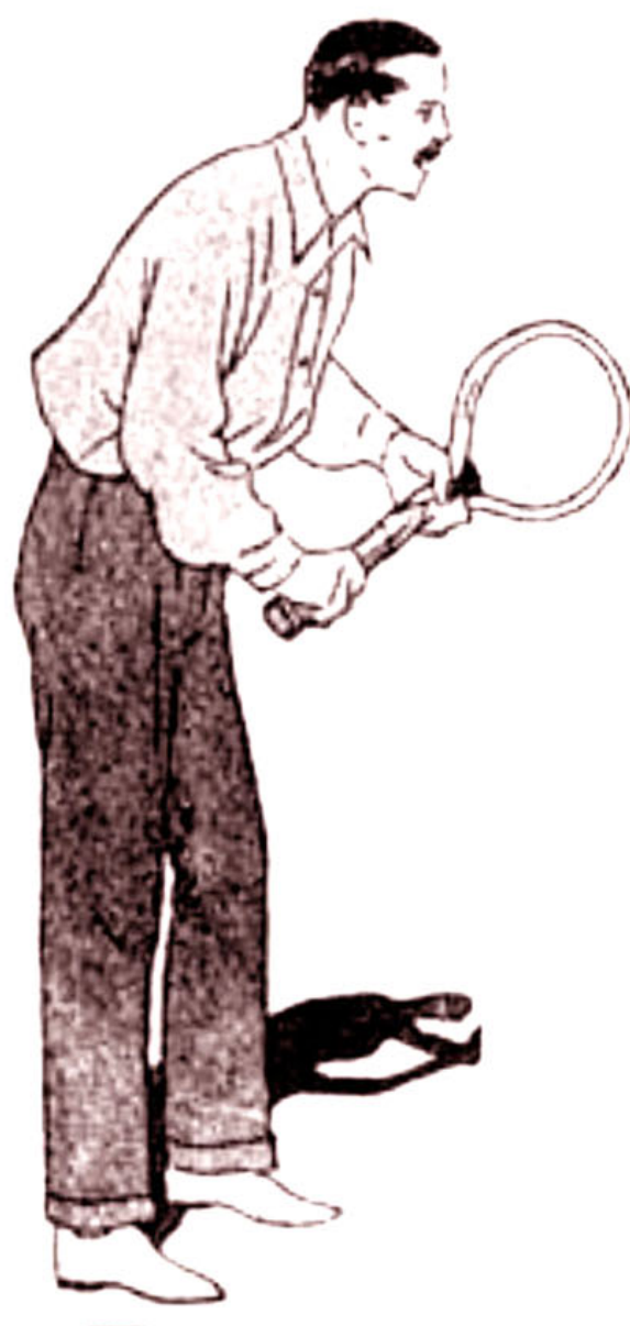
(4) Sketch of cotton cheviot shirt and trousers for tennis in two shades of grey, the trousers darker