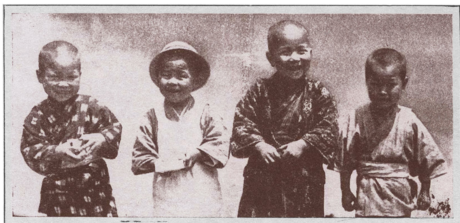
Behold the Yellow Peril!—four sunny appealing little sinners the sight of whom must certainly strike terror to the stoutest heart

Secretary of the American League of Justice