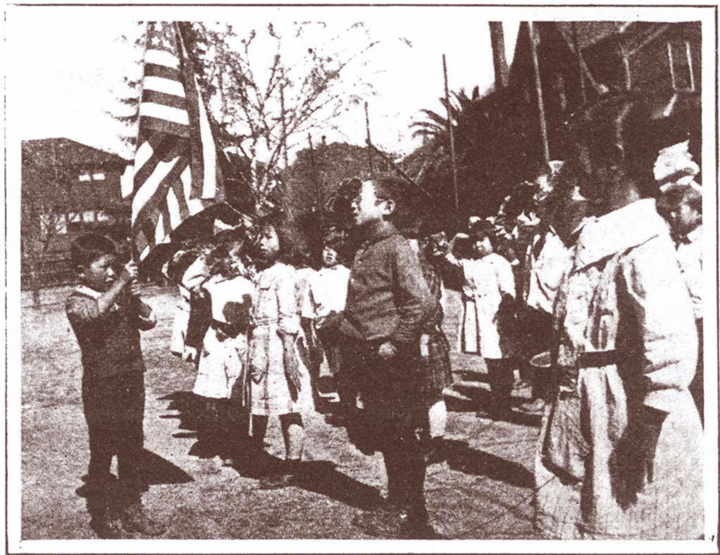
Native born Japanese children of the McKinley School in Berkeley, California, saluting the American flag. These children are going to carry loyalty to America into their homes and to their parents

their scientific attainments have gained for them a respect from the white peoples, which we who know them so well fully share."