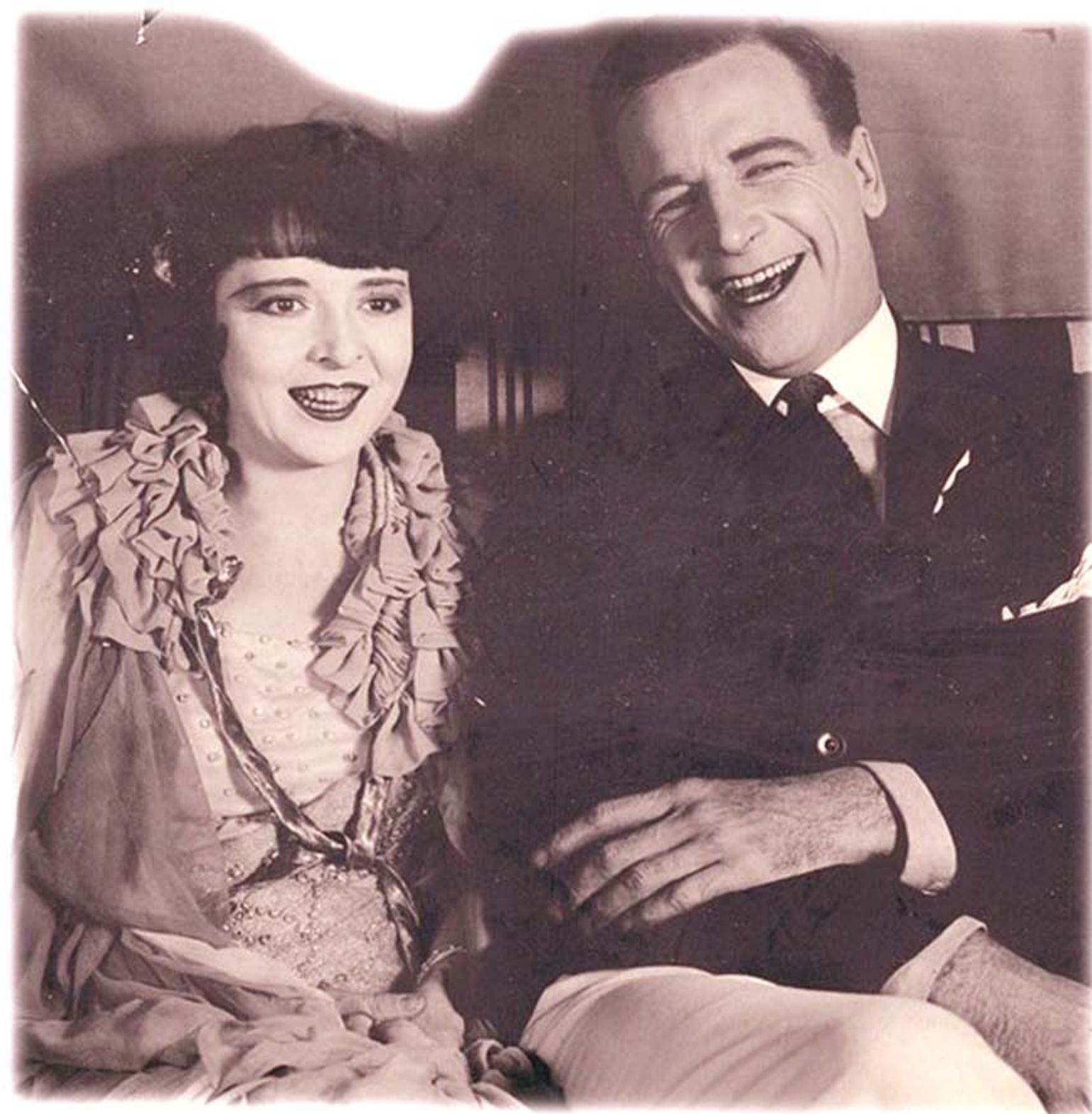
Colleen Moore and Milton Sills as seen in Flaming Youth (1923)

Flaming Youth endeavors to establish that young men and maidens wild are going up in the smoke of their own cigarettes. It contains all the rabble of trashy devices which cinema directors employ traditionally to indicate the younger degeneration, even to the midnight bathing party. All this is unfortunate, since the story of the socially rabid mother who on her deathbed persuaded her physician to write her spirit letters of her daughter's progress, is rather ingenious. She gave the girl the combination of the safe where the letters were to be left, hoping that the reports and reflections therein would fortify her philosophy against a jazz-mad world. Milton Sills and Colleen Moore make much of the leading rôles.