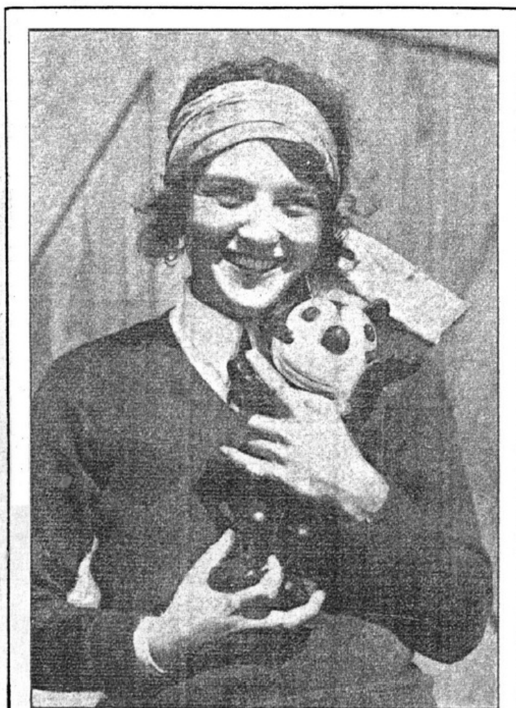
"FELIX THE CAT" ALSO FLEW

In cheery contrast to these misogynistic views