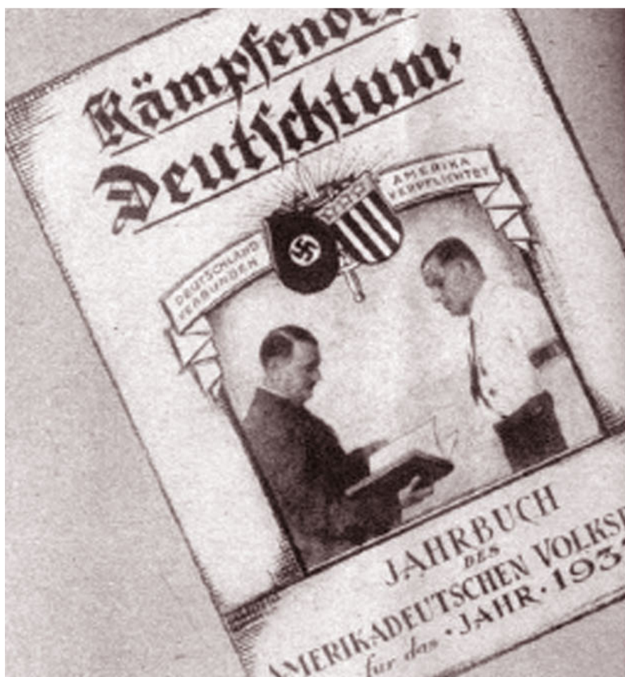
"FIGHTING GERMANISM" is the slogan of this Bund yearbook. Note the picture of Hitler receiving Fritz Kuhn and the symbolic welding of U. S. and Nazi flags.