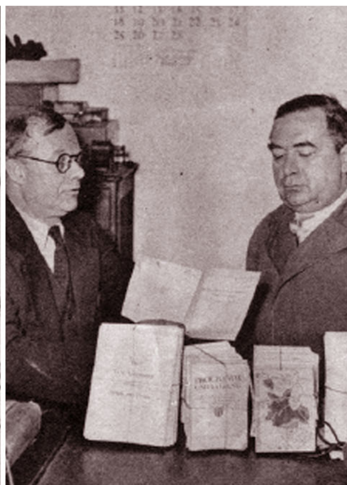
PRO-NAZI propaganda circulars were seized from the German ship, Estes, in New York in 1934. This is an example of the bold plotting of Nazi agents.