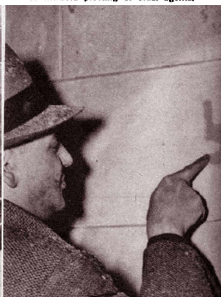
NEW YORKERS were shocked to find swastikas painted on a Jewish Synagogue in 1937. The low vandals who did this were not found.