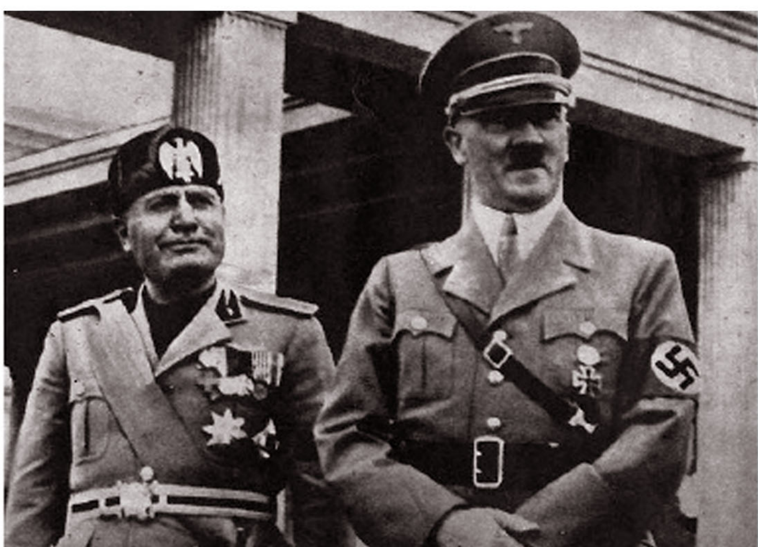
THESE BOYS know that it pays to put on a good show. They have developed the knack of fooling their public by obscuring real issues behind clouds of pageantry and invective. Will free, democratic America ever fall for the same sort of thing?