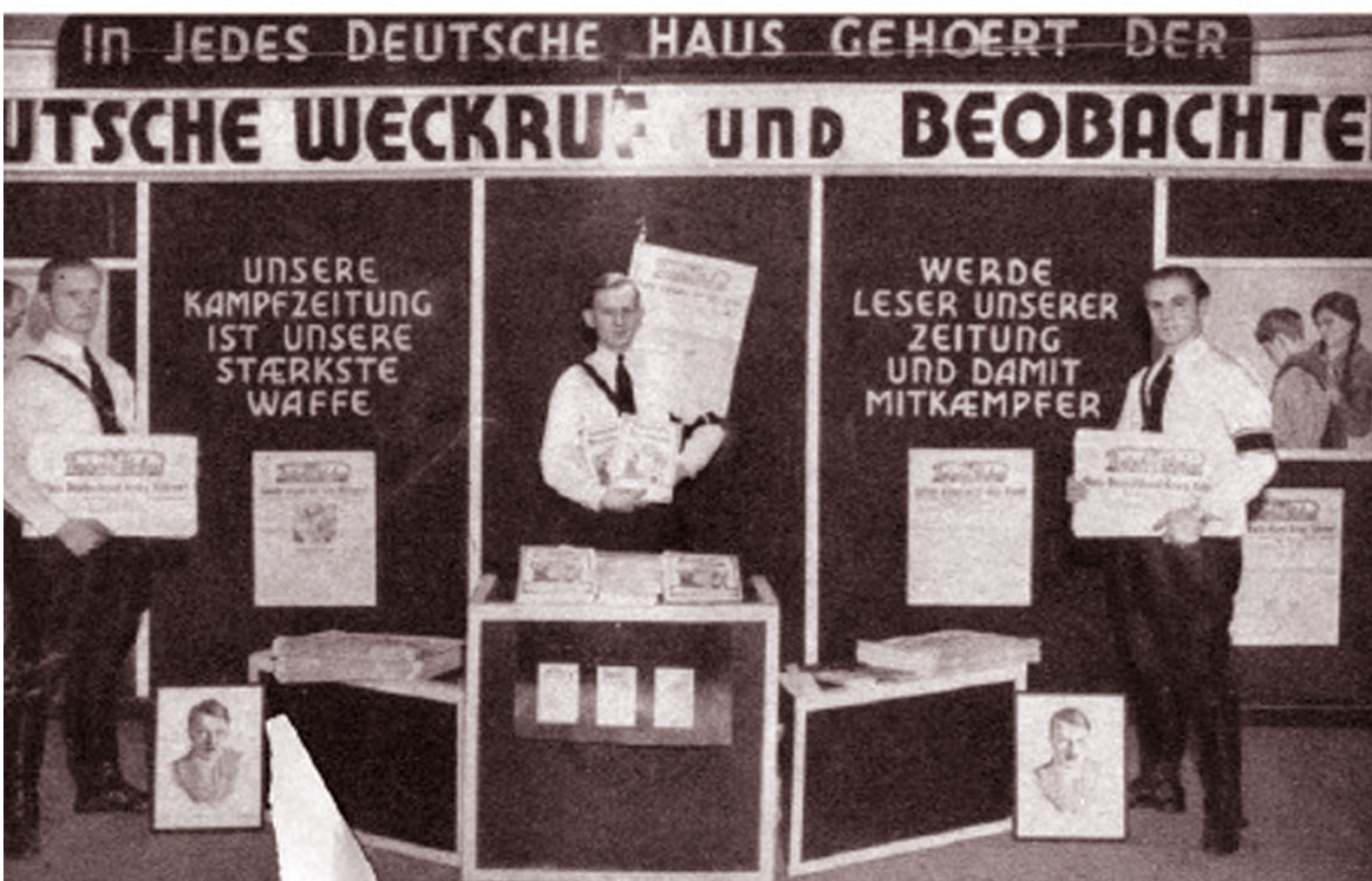
THIS BOOTH was a feature of a Nazi celebration in New York's Madison Square Garden last year. It advertised the German Awakener and Observer, official newspaper of the Nazis in America. Note the uniformed attendants on duty and the pictures of Adolf Hitler.