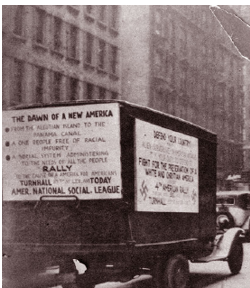
FIVE NAZIS had the effrontery to drive this truck through New York's heavily Jewish garment district. They were beaten up.