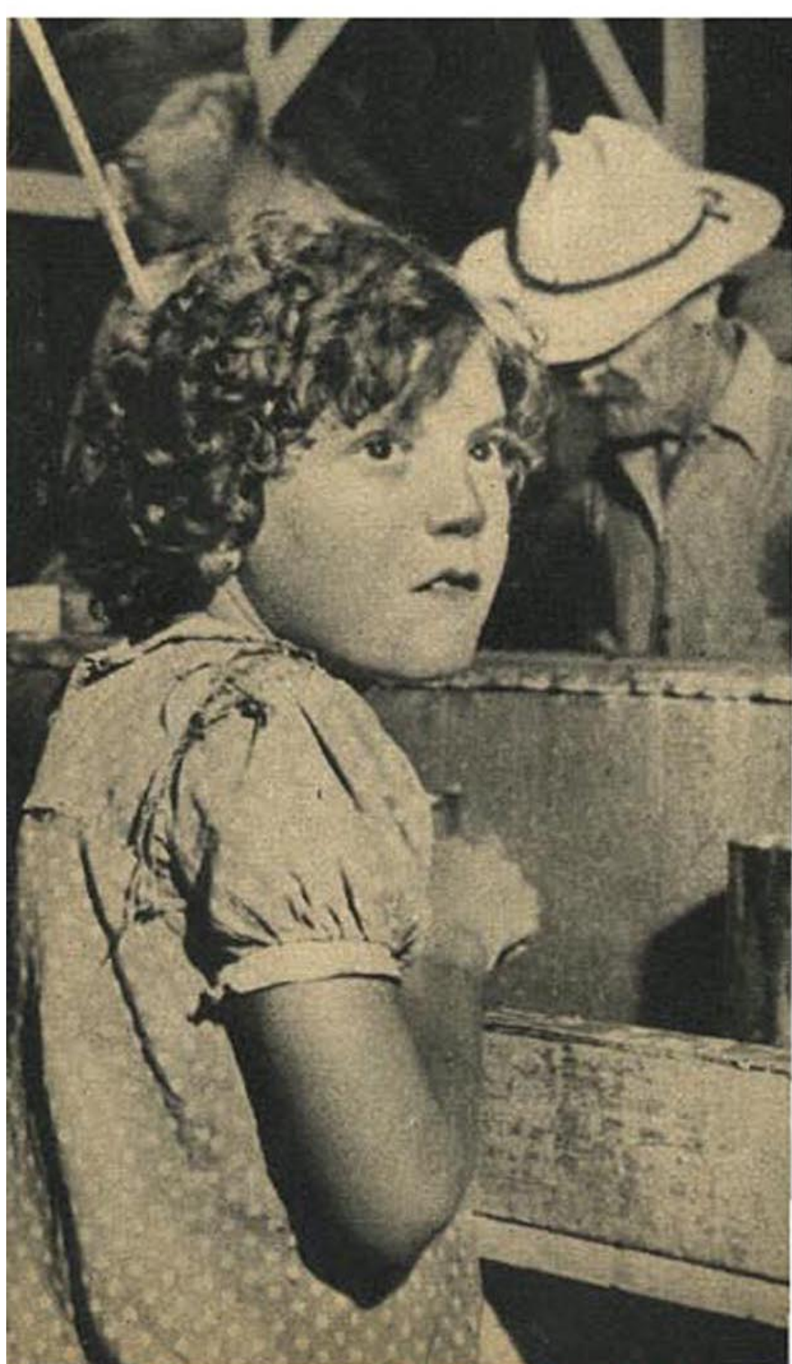
THIS LITTLE GIRL of six stands on a box so that she can reach the shrimp. Work begins at four a.m.