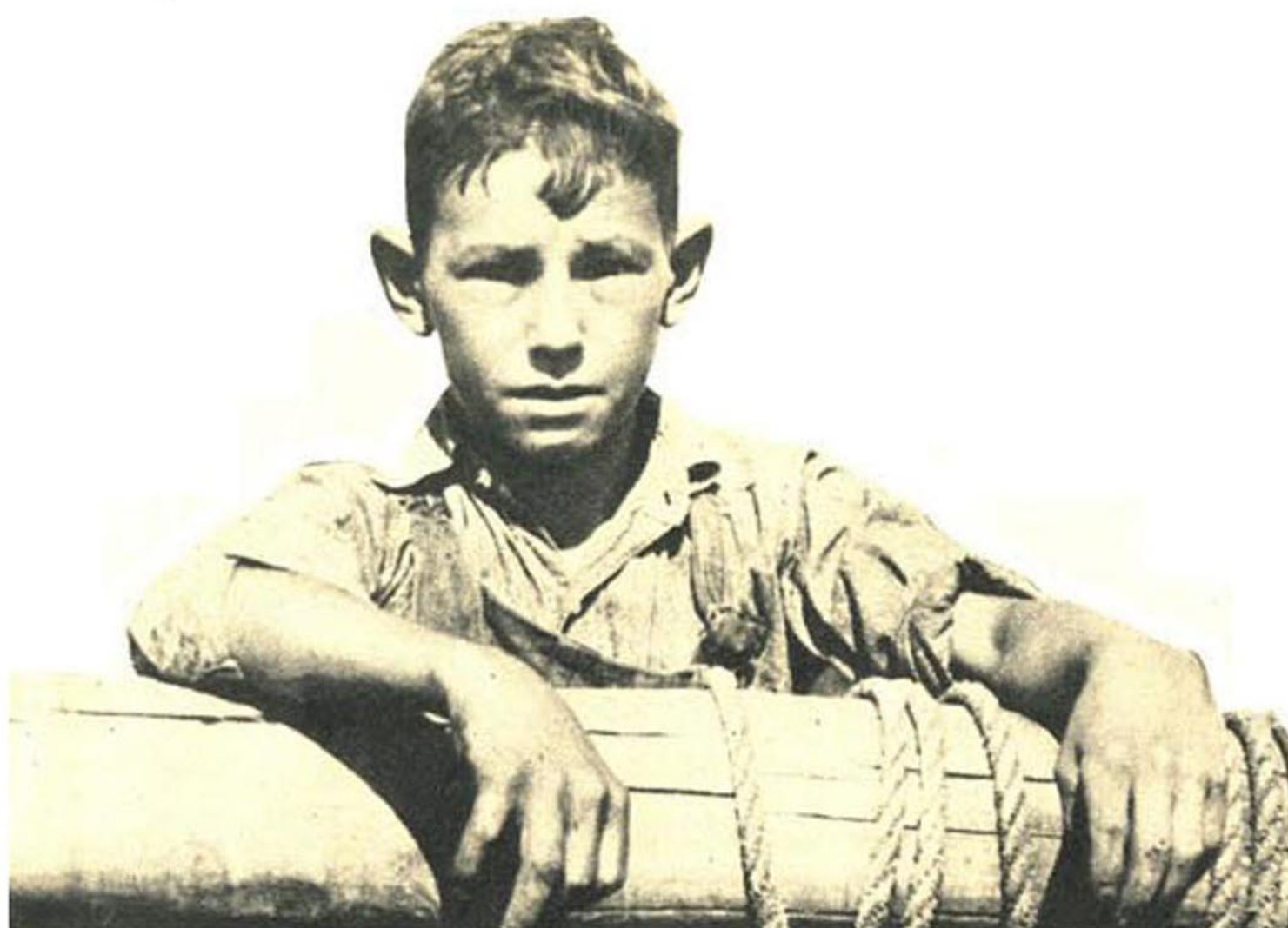
THIS THIRTEEN-YEAR-OLD "tiff" worker in Washington County, Missouri, has made his own living and contributed to the support of others since he was eight.

In the Gulf States of Mississippi, Louisiana and Texas, children as young as six years old, many so small that they have to stand on boxes to reach the tables, go to work in the shrimp picking sheds. Children are used in two jobs. One is pulling off heads and hulls from the shrimp meat in preparation for canning. The other is "heading," or removing the heads only, before icing the shrimp for raw shipment. The hours of labor begin when the shrimps come in, sometimes as early as one o'clock in the morning. It lasts until the "catch" is finished and then begins again in the evening and continues until the second "catch" is dressed. The average wage for children is thirteen cents an hour. In most instances their meager earnings are collected by their parents.