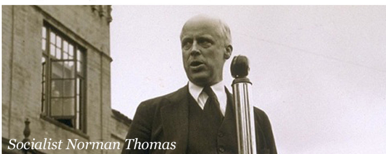
Socialist Norman Thomas