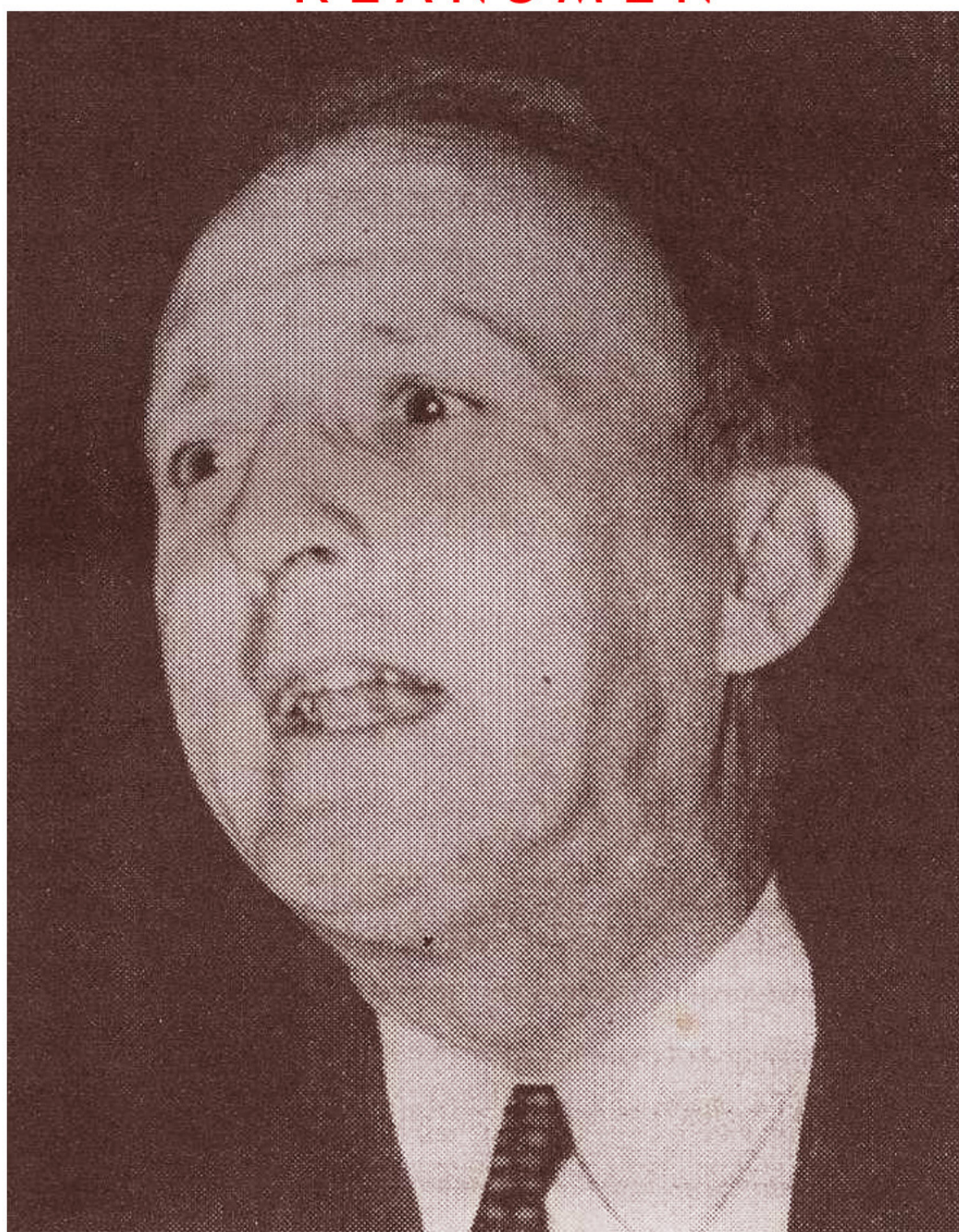
HUGO BLACK , alleged Klansman, is opposed for Supreme Court seat.

The original Klan did not last long. It fell largely into the hands of adventurers whose irresponsible lawlessness gave it a bad repute; and after a few years the Southern whites had so far regained their local power that there was no longer any defensible pretext for such an extra-legal force. By 1872 the Klan was on its way out. For more than fifty years it was only a memory.