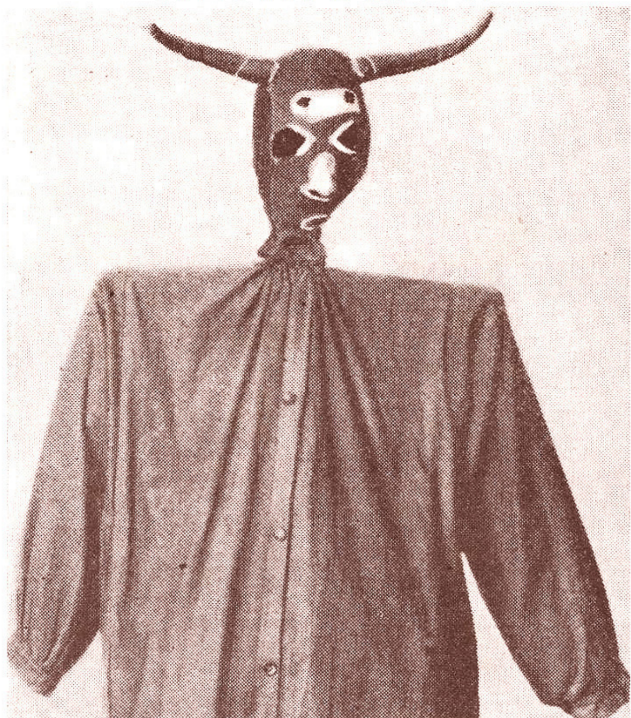
KLAN UNIFORM of 1870. This one brown, others white, worn by various Klan groups—Knights of the White Camelia, Pale Faces, The Brotherhood