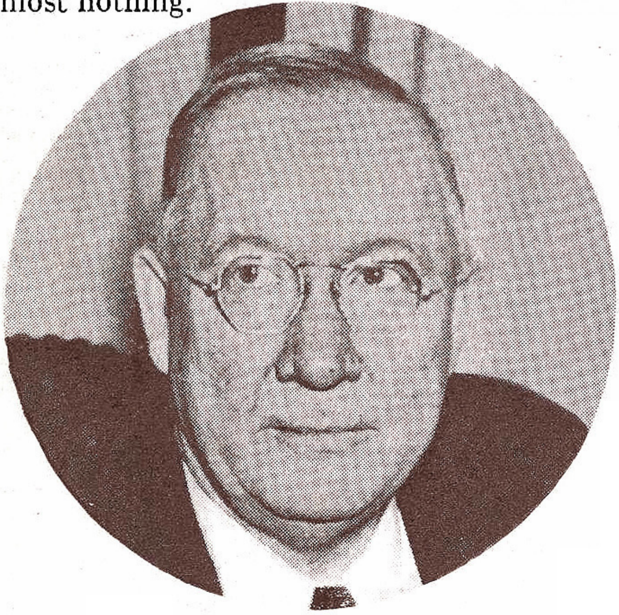
IMPERIAL WIZARD of the Ku Klux Klan, Hiram W. Evans, is anti-Jew, anti-Catholic, anti-Negro

Yet by the end of the 1920's the Klan had almost disappeared. What killed it? The waning of the post-War angers; rising prosperity; sober second thought, probably, on the part of those who had joined the Klan from unselfish if ignorant motives and were dismayed to find it coming under the grip of local thugs and swindlers; the natural inertia which weakens such organizations after the first frenzy of activity; and, presumably, a shamefaced inability to stomach any longer its infantile mumbo-jumbo. When the depression came along, the dues-paying membership shrank to almost nothing.