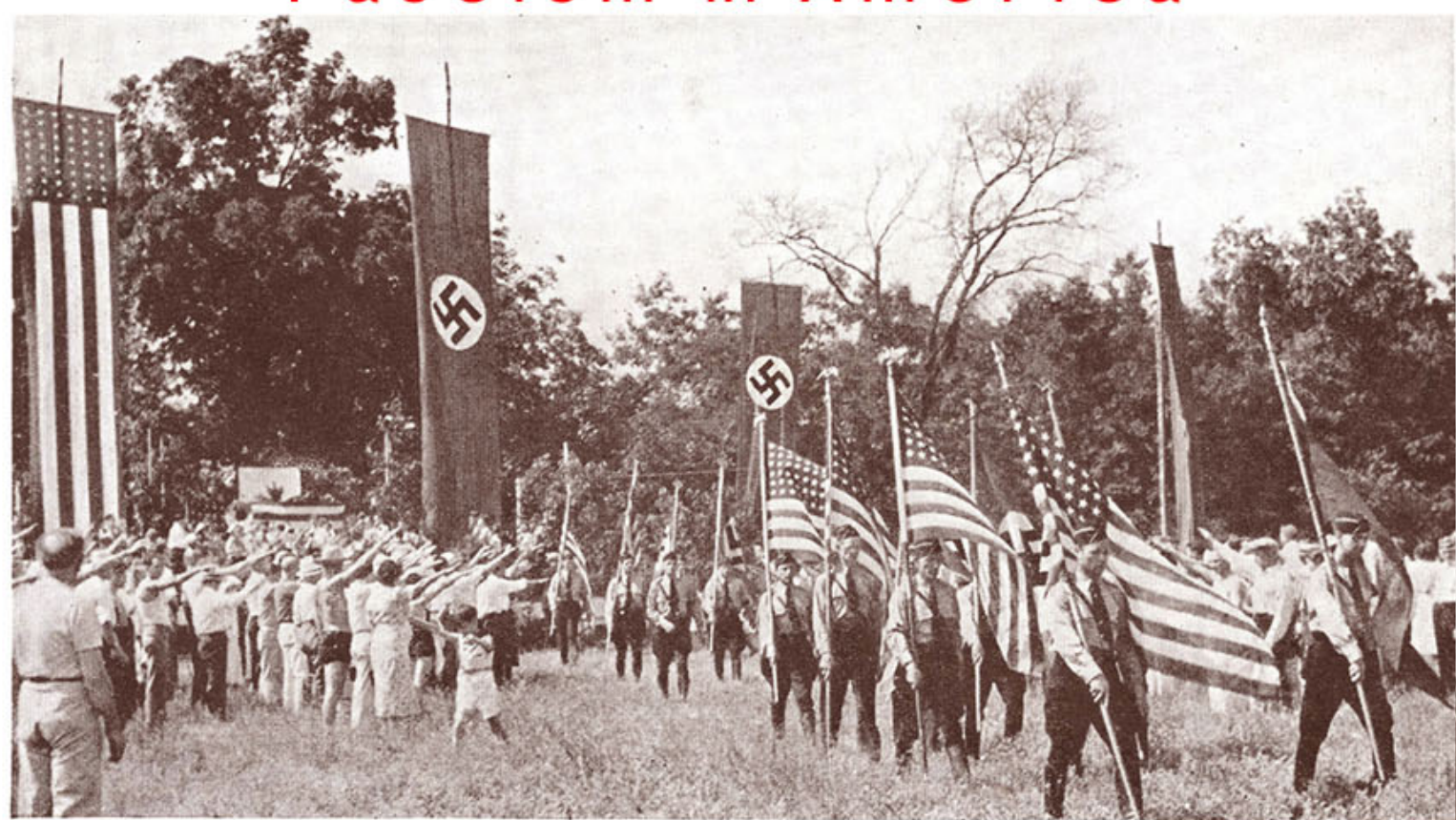
BOOTS, BREECHES, SAM BROWNE BELTS bring swastika to Camp Nordland, New Jersey, where the nazi goosestep of the German American Bund brings goosepimples to haters of dictatorships, lovers of American democracy—and communists