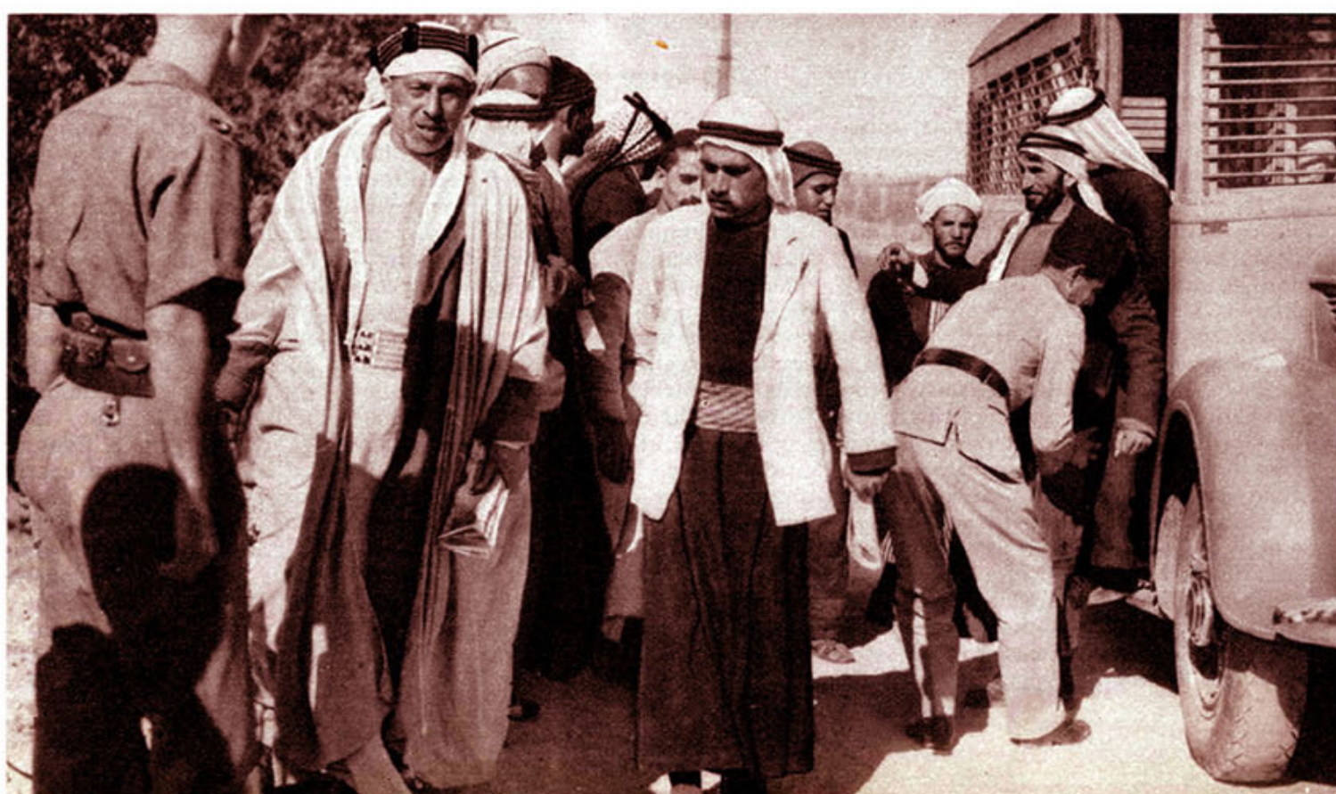
British troops, in an unrelenting search for terrorists, look for guns on passengers of a bus in Jerusalem

She took definite steps toward granting the Arabs some form of political autonomy.