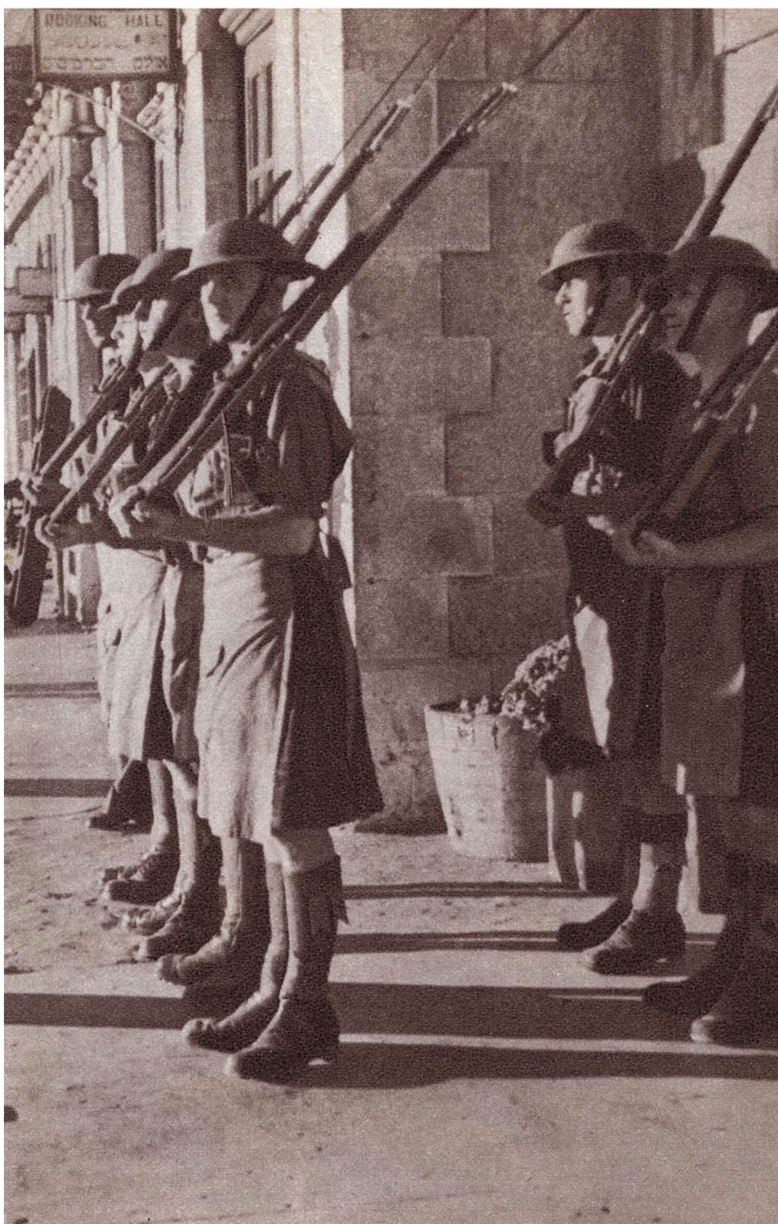
Constant vigilance is the price of order in Palestine. Above, a detachment of Cameron Highlanders guards one of Jerusalem's streets

Despite precautions and the alertness of sentries, small bands are occasionally spotted. That means arrests, jail and the third degree. So far at least 500 have been arrested and sweated. But the British authorities haven't been able to find out where their real rifles and machine guns and grenades are hidden.