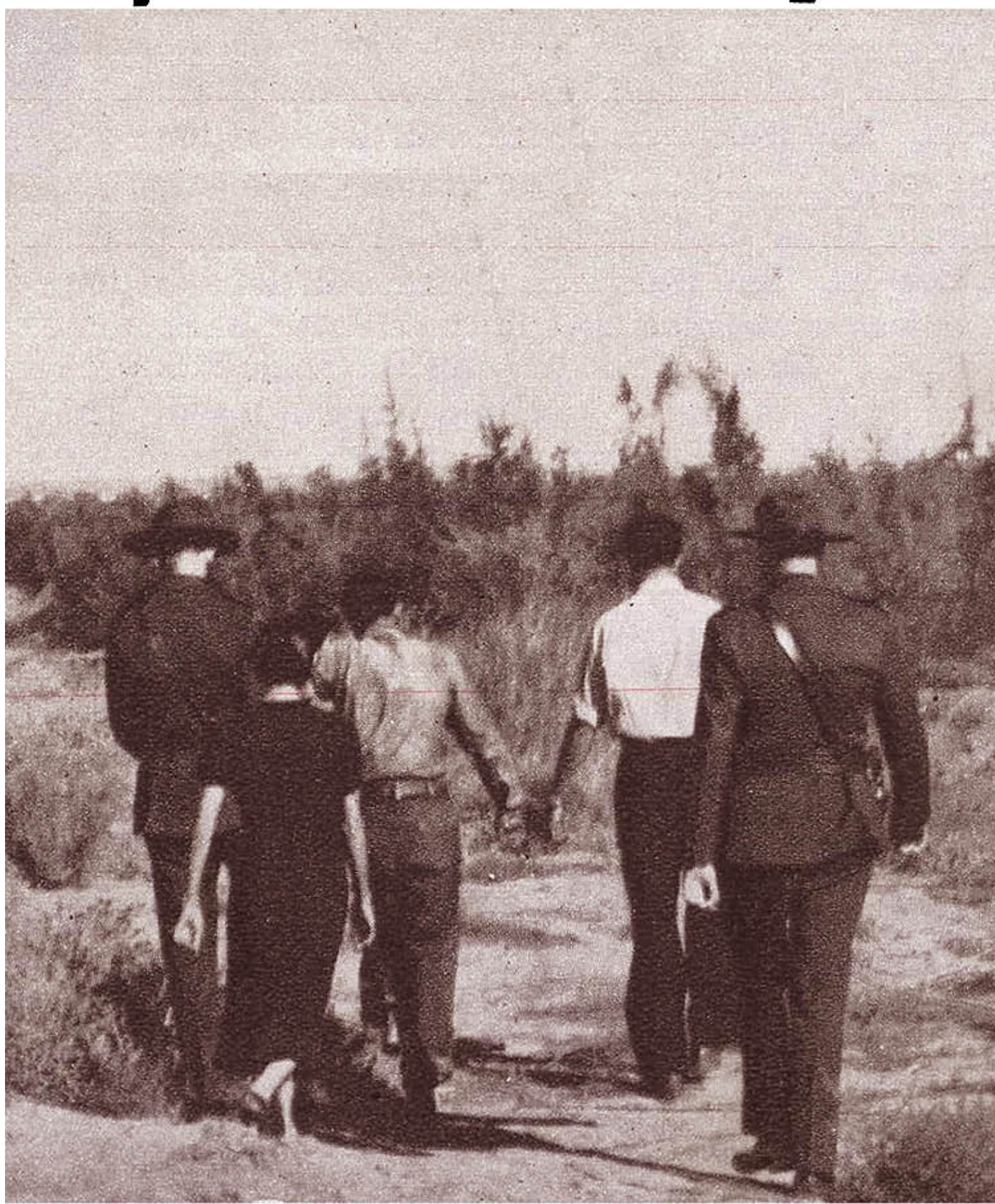
Family of aliens caught crossing the border is escorted to Border Patrol headquarters where they will be questioned

You've got to be young—and healthy. You may be bored or you may be shot. You'll freeze and fry. It won't make a man of you because you're that if you get in. So, meet the