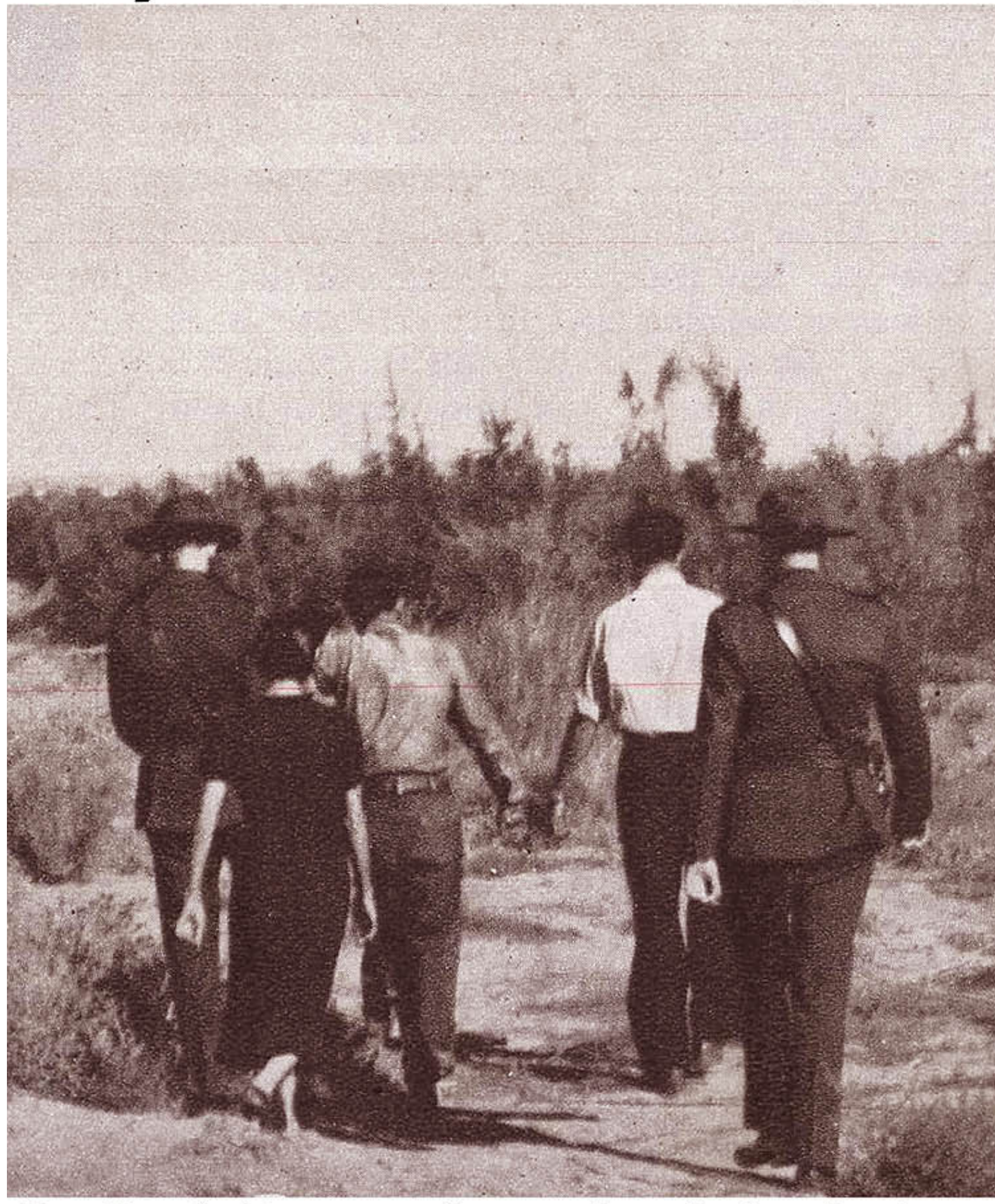
Family of aliens caught crossing the border is escorted to Border Patrol headquarters where they will be questioned

You've got to be young—and healthy. You may be bored or you may be shot. You'll freeze and fry. It won't make a man of you because you're that if you get in. So, meet the