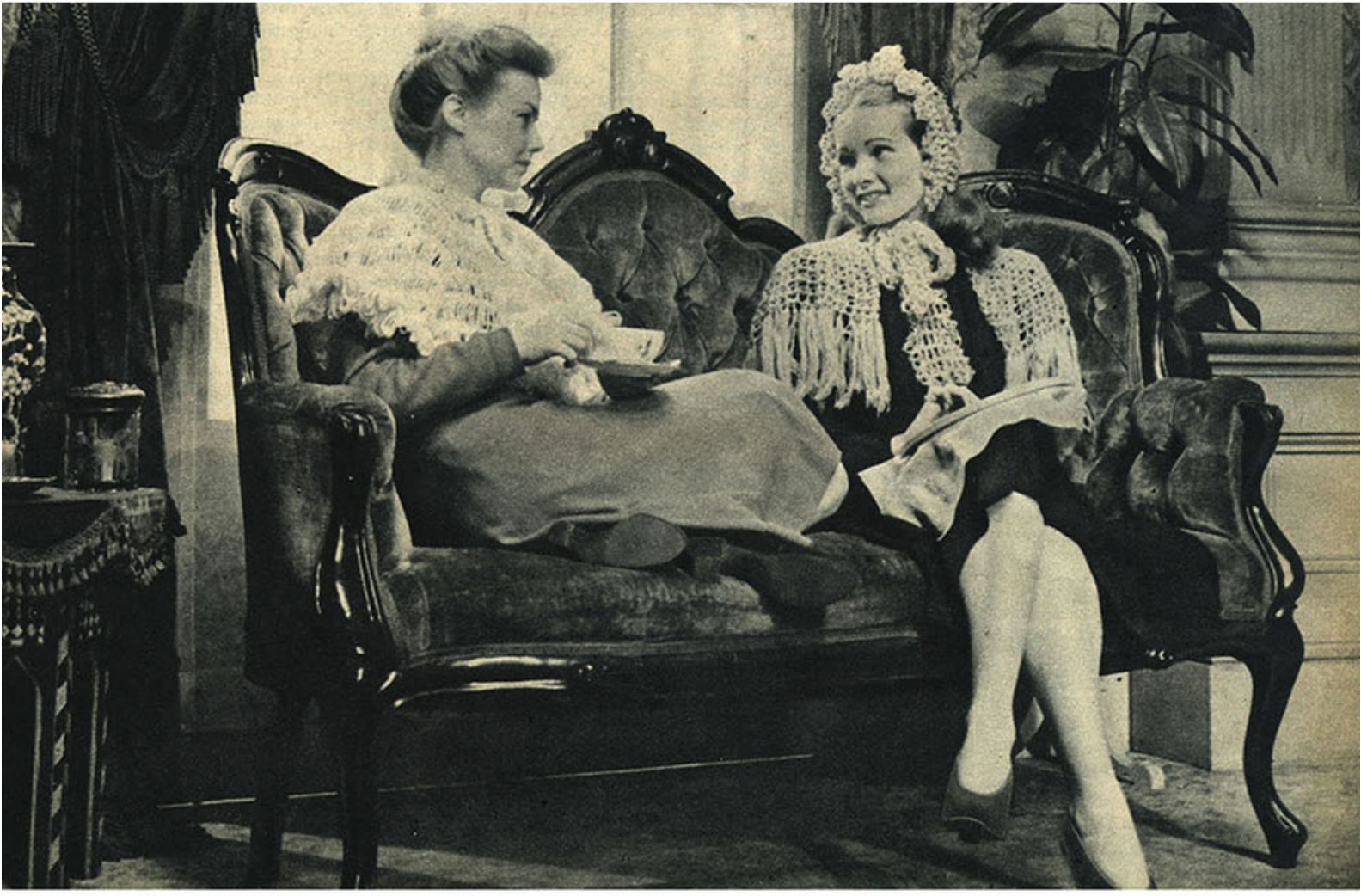
CAPELETS FOR FIRESIDE WEAR OR WORK BENCH MAKE UNDER-HEAT ROOMS MORE COMFORTABLE. THE MATCHING CAP IS USED IN OR OUT-OF-DOORS