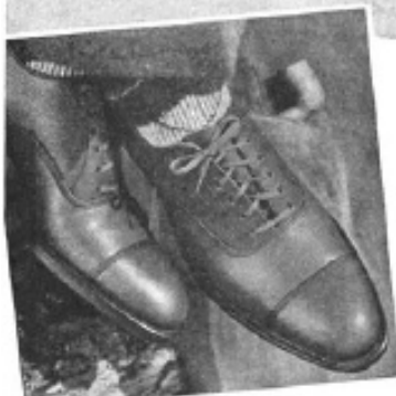
RUGGEDIER GRAINS —Bostonians' answer to winter walking. Heavy soles for men who won't jump puddles. Above, Tech.