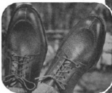
WHISTLE while you walk in Walk-Fitted Bostonians. Leathers give and take with foot action. Above, Stalwart in Scotch grain.