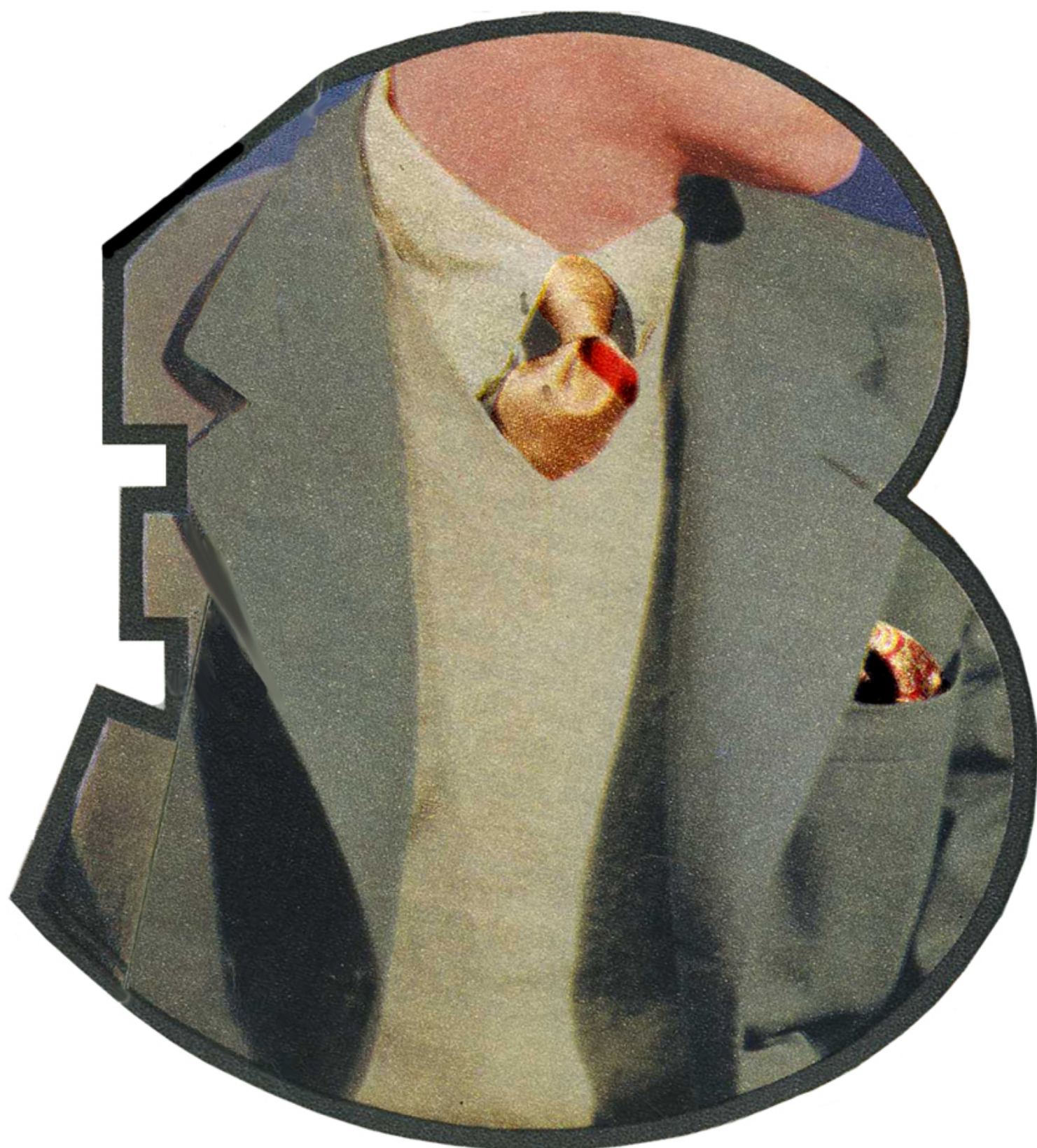
No. 3 shows the effect of a tan Glen plaid shirt with harmonizing striped tie and foulard handkerchief, plus a natural-color lightweight wool sweater.