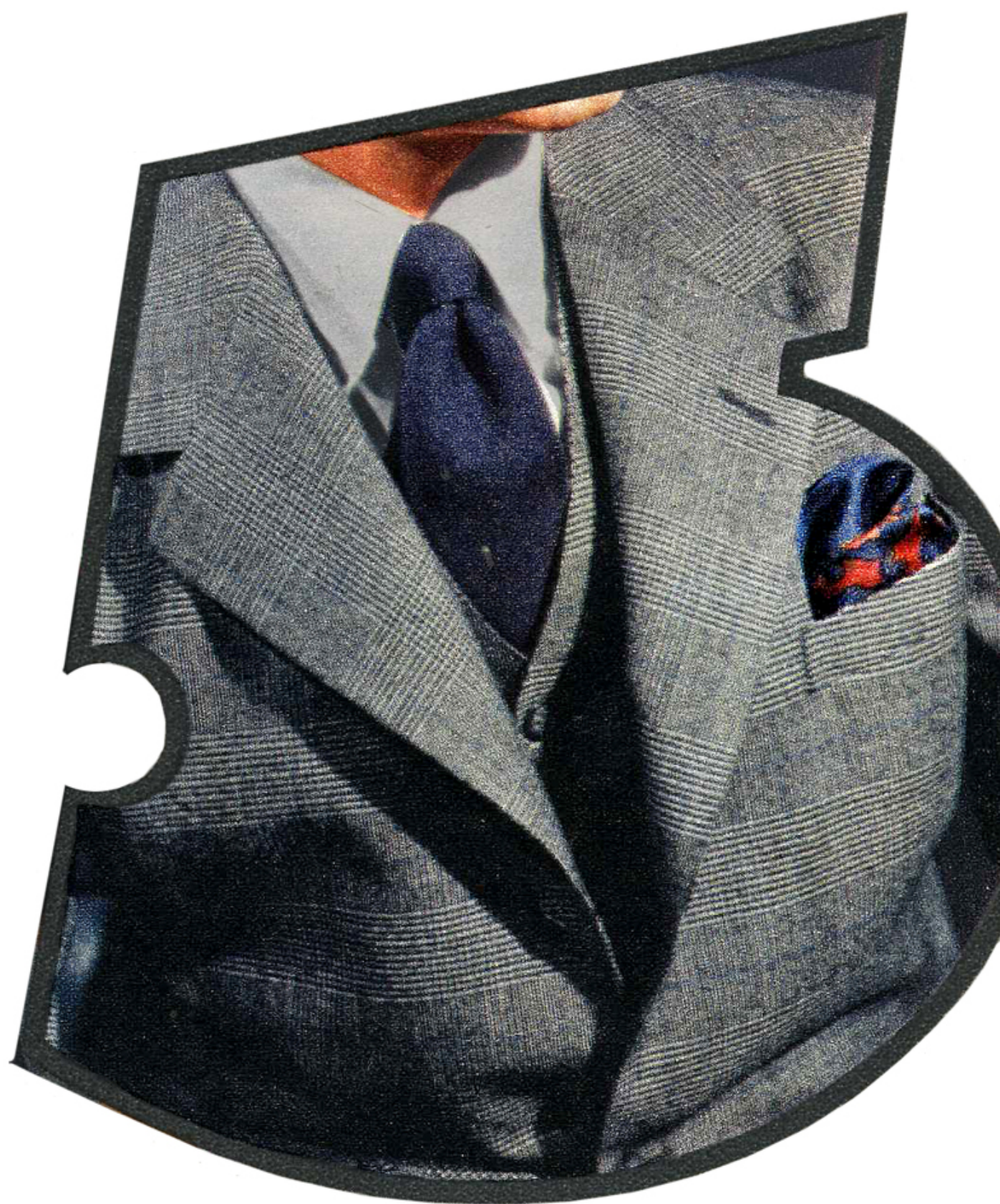
Close-up No. 5, silver-gray twill shirt with blue wool tie and blue foulard handkerchief, all matching up with the gray plaid with blue overplaid.