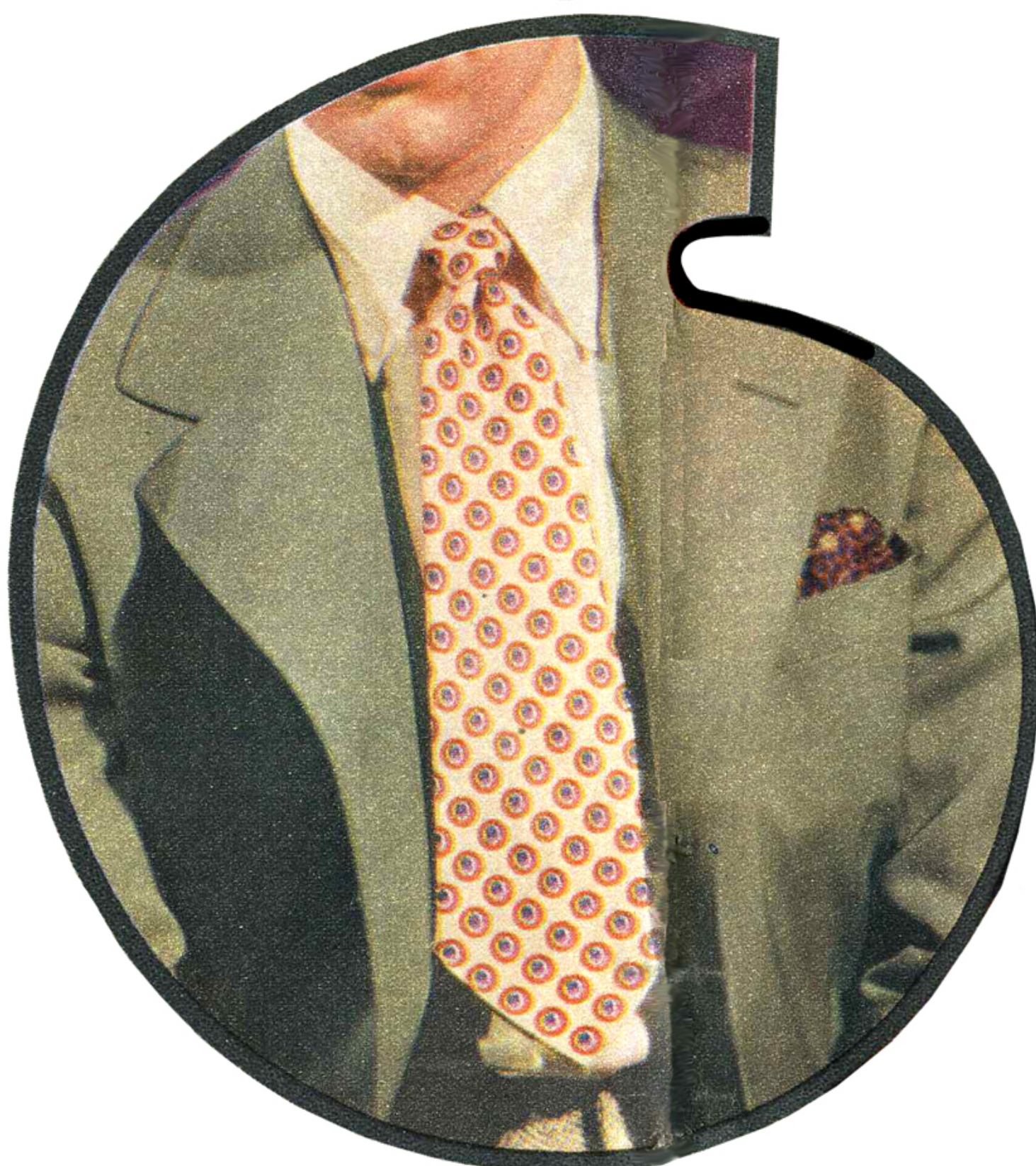
No. 6, yellow oxford shirt with white stripes, parchment tie with contrasting color, natural color gabardine suit