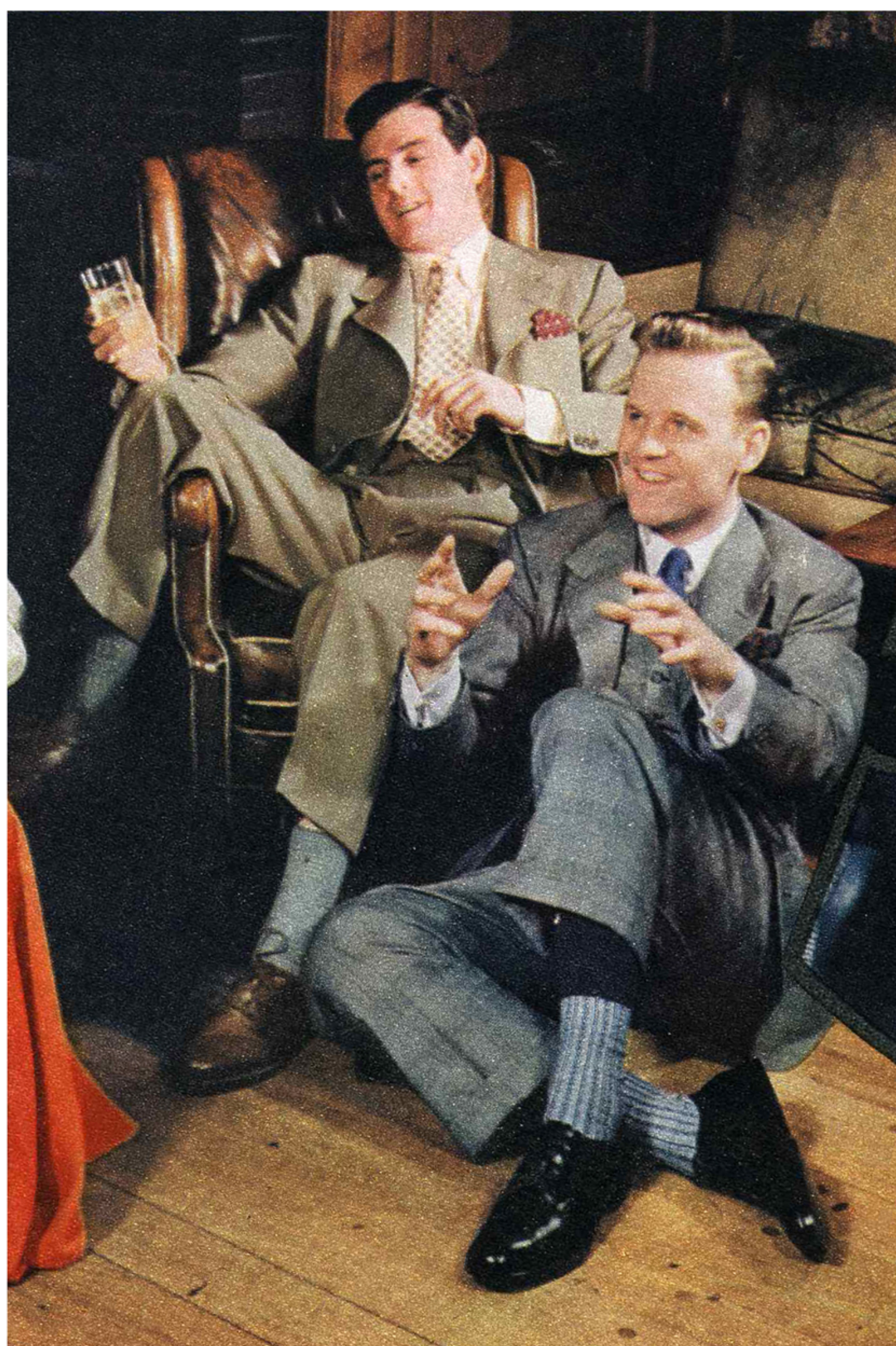
The young week-end loafer at the left has eased into a gabardine suit, an oxford shirt, a foulard tie and a drink on the house. The other guest is completely at ease in a Glen plaid.