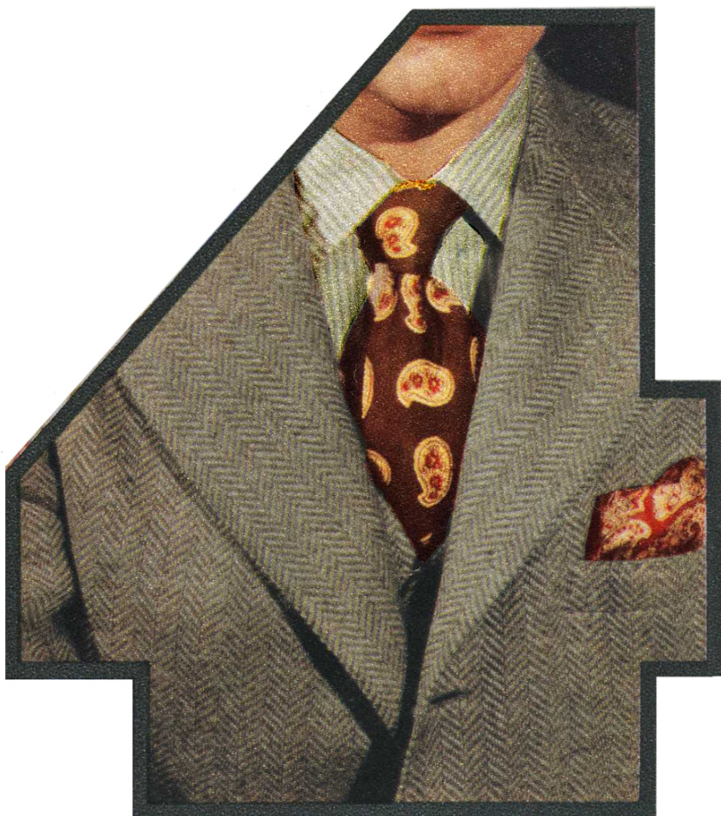
No. 4 sets against the natural-color Shetland herringbone suit a tan-and-white candy-striped oxford shirt, a brown, red and yellow India silk tie, complementary handkerchief