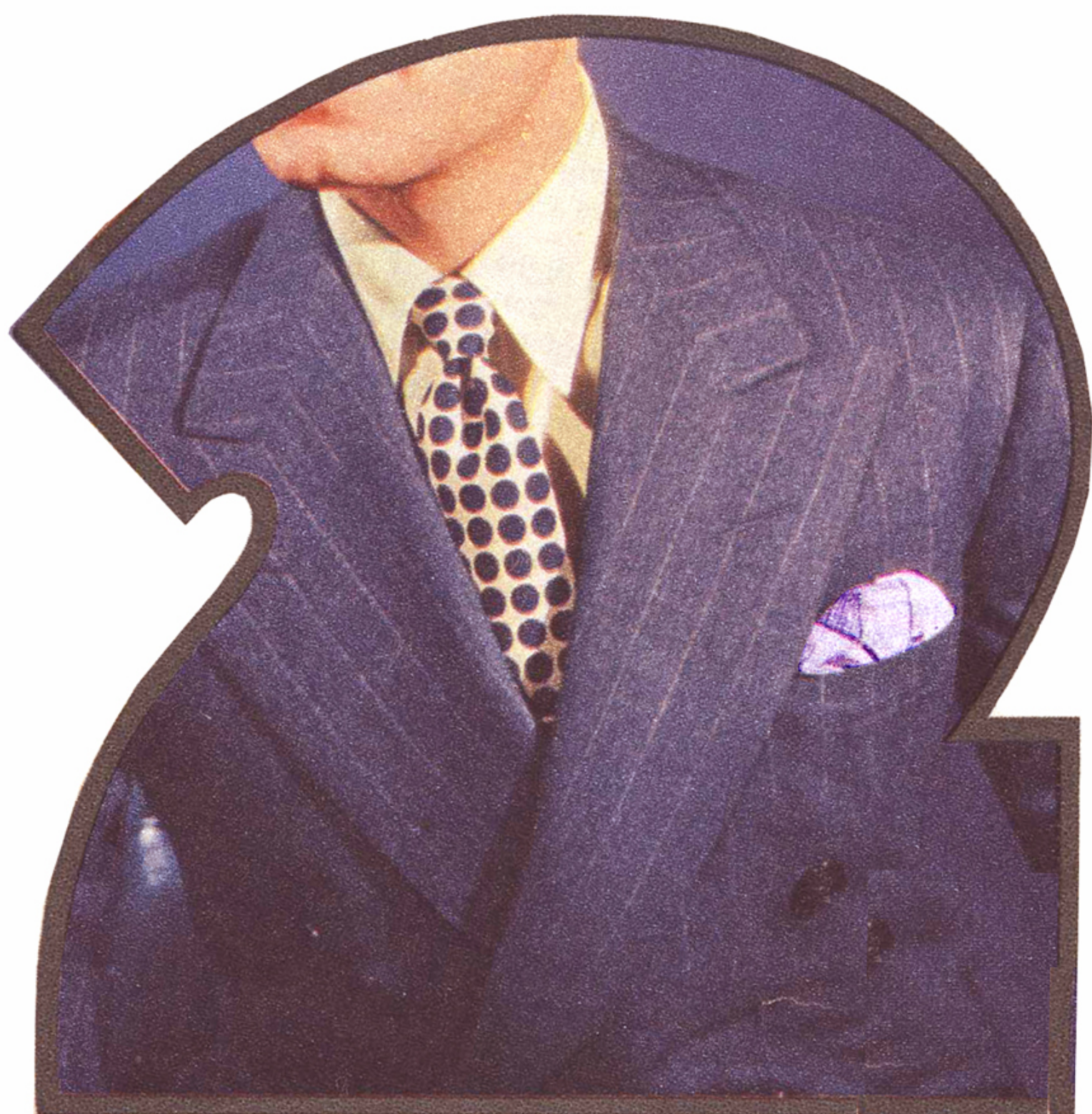
No. 2, pale yellow broad-cloth shirt with navy-spotted, corn-color tie, blue-bordered handkerchief and gray-blue suit

For the cool of the evening, a covert topcoat will keep you comfortable in town or country, but be sure it's a loose, casual model—not form-fitting. And if the country air is a few degrees cooler than the city, blend a sweater into your ensemble.