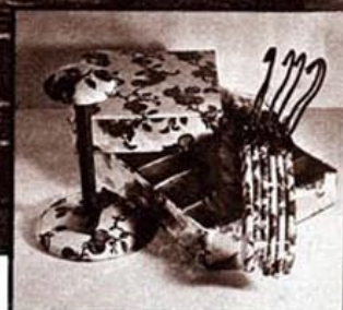
THE ORDER becomes easy randeur Product closet ries in the red apple print.