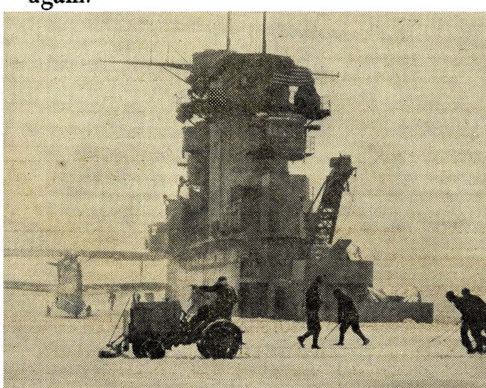
A SNOWPLOW is part of a carrier's equipment for clearing the deck on Winter patrol duty. Blizzards, fog and stormy weather hamper flying operations, and carrier must depend on speed and its destroyer escort for protection.

Carriers began to punch with full force when Japan and the U. S. A.—the two nations that had specialized in that type of vessel—went to war. Jap planes sank the battleship Arizona and capsized the Oklahoma at Pearl Harbor. Then torpedo planes popped off Britain's battle cruiser Repulse and the new battleship Prince of Wales. The U. S. A. has lost the Lexington, but has sunk five Jap carriers and damaged at least one more. That was heavy punishment, but there are more carriers in fighting trim on both sides, and they will be heard from again.