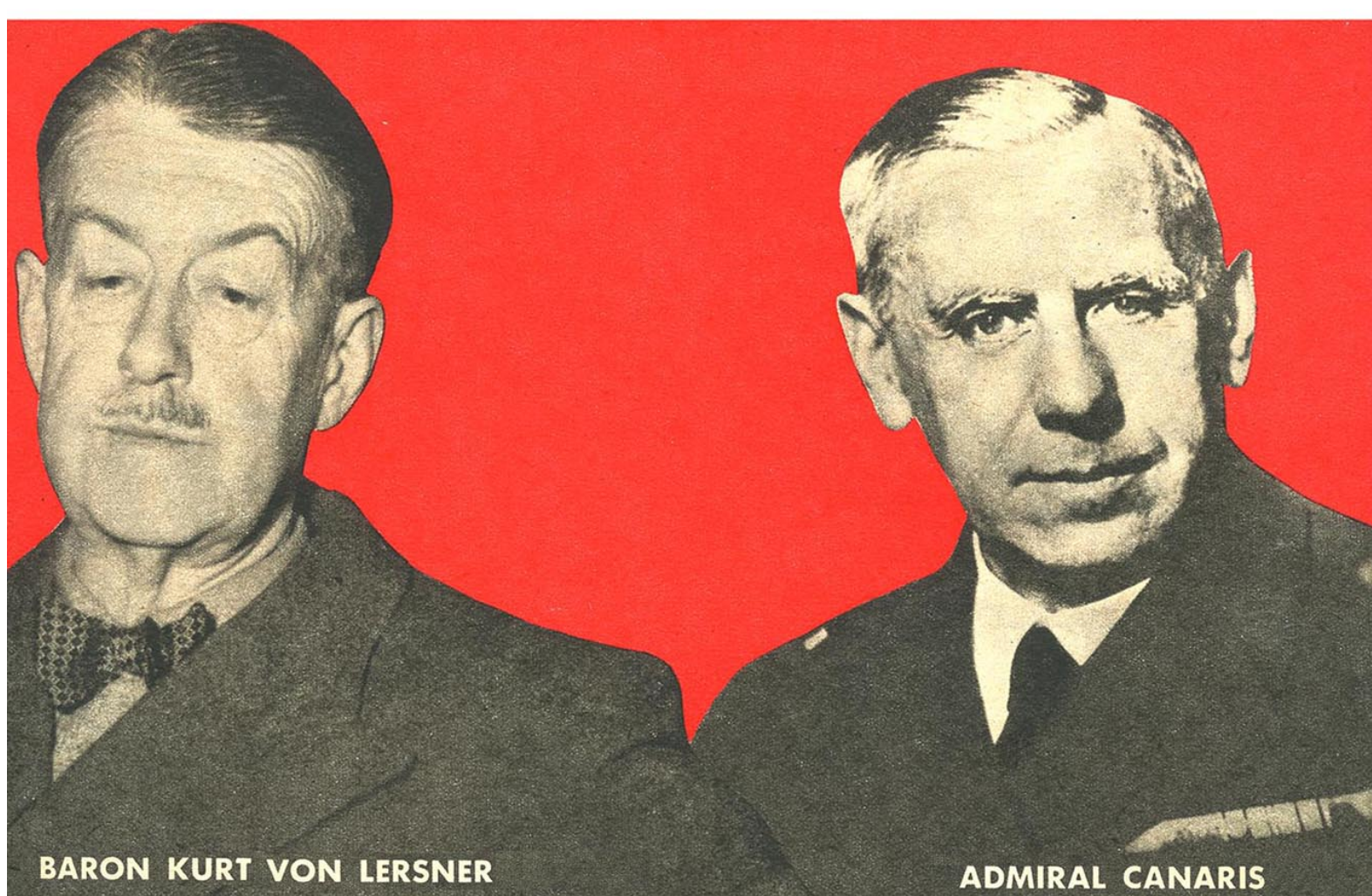
BARON KURT VON LERSNER

At a little after nine that (Continued on page 56)