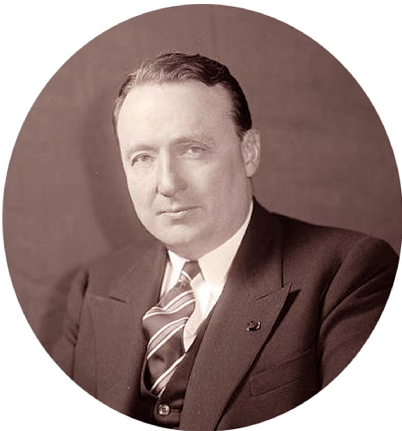
Ex-Gov. George H. Earle

GEORGE H. EARLE is one of the most colorful, outspoken and independent figures of the contemporary American political scene. He entered politics in 1932, abandoning his family's traditional Republicanism to support FDR for President. Roosevelt appointed him minister to Austria in 1933. Earle resigned a year later to run for governor of Pennsylvania and became that state's first Democratic governor in 44 years. His "Little New Deal" administration resulted in the passage of two volumes of laws effecting social and humanitarian reforms in the Keystone State.