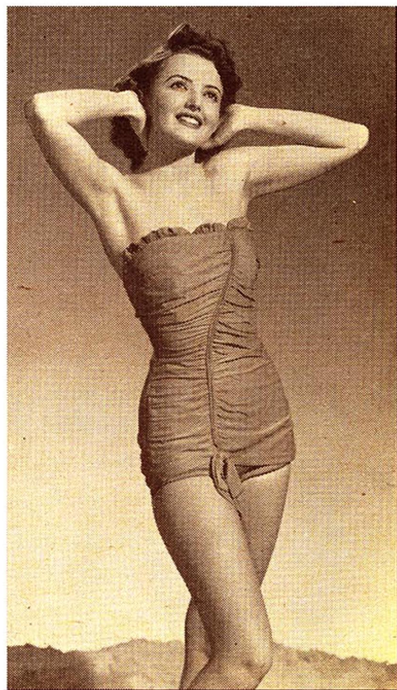
SWIM SET. Joyce Reynolds, Martha Vickers and (above) Janis Paige.