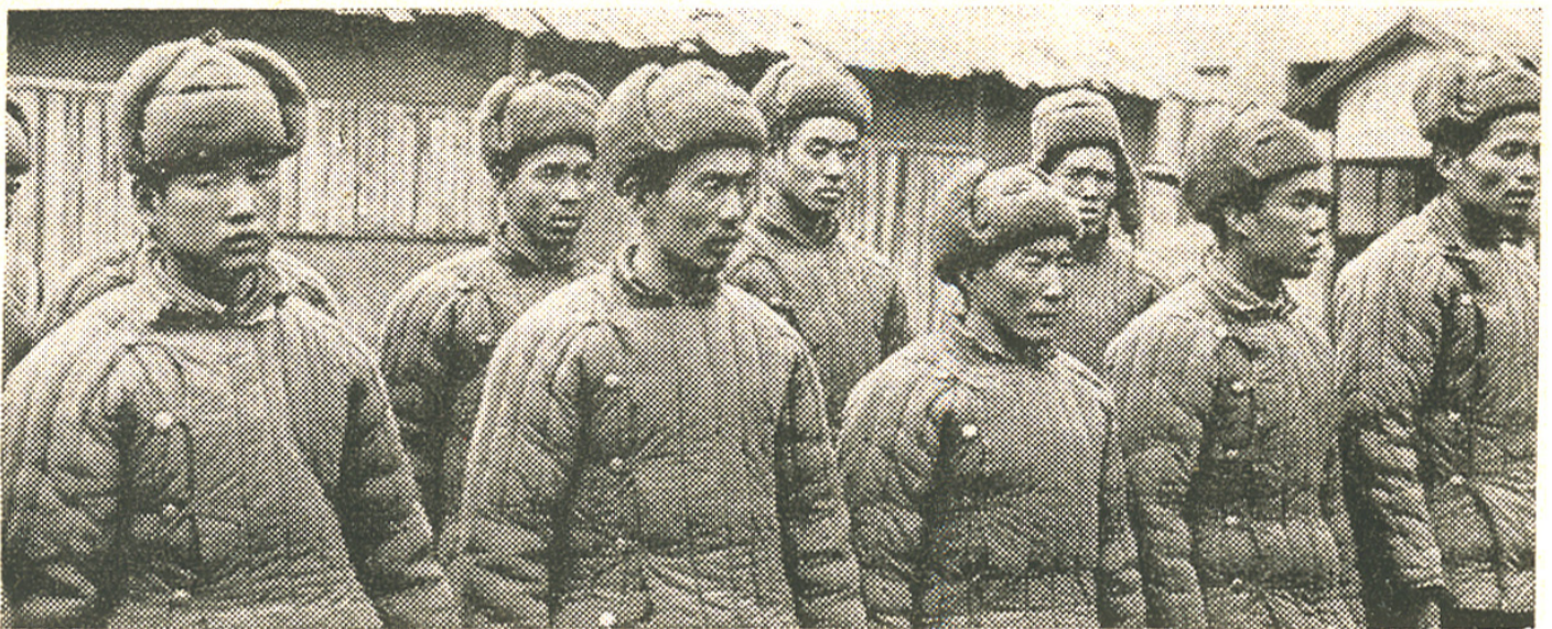
Caught in Korea: Chinese Communist prisoners in U.N. stockade.

Threats of a general war in the Far East grew as perhaps 250,000 Chinese Communists jumped into the battle for Northwest Korea;