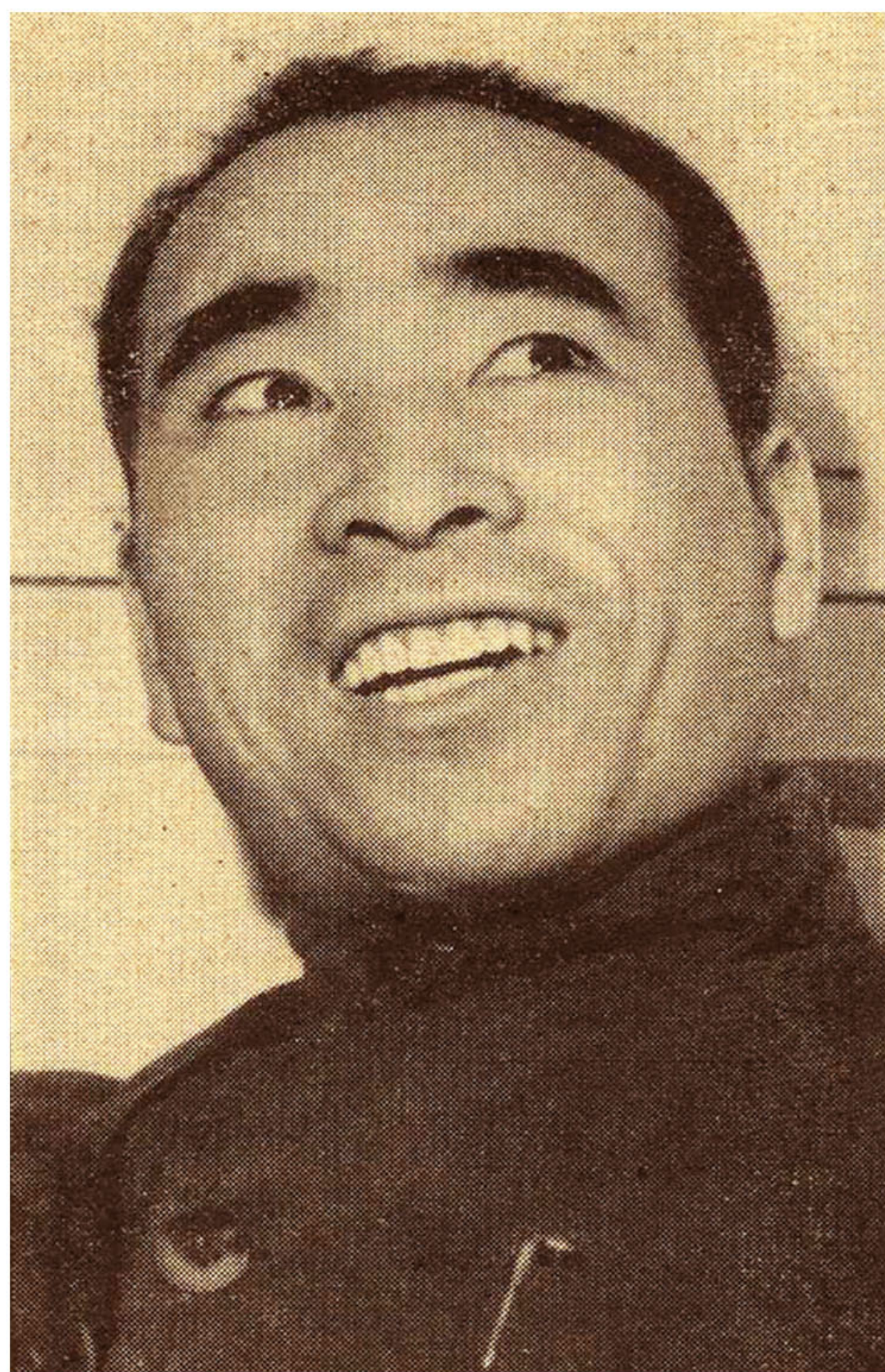
Gen. Lin Piao. On soft pickings, never a battle lost.

A captured Chinese told American officers: "In the evening we had to be able to repeat the morning's lesson by rote. If we couldn't remember it, we would be locked in solitary confinement."