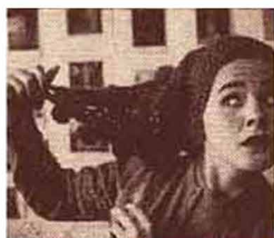
Corsican cap (Madcaps)