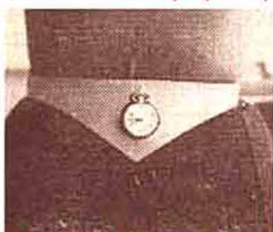
Watch belt (Frank Speyer),