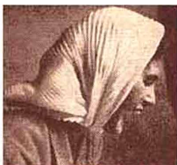
Head scarf (Symphony),