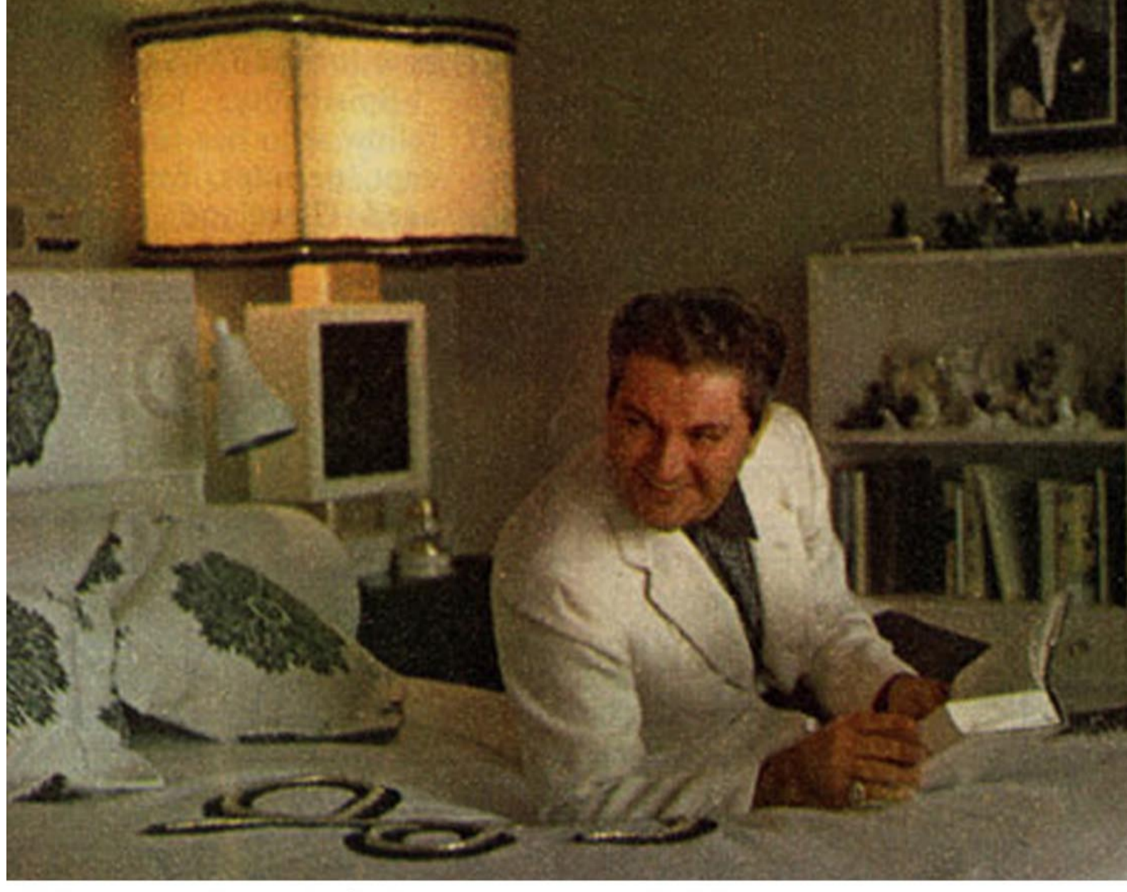
Liberace relaxes in bedroom, surrounded by reminders of himself—like initial on his bedspread and the picture hanging on his wall