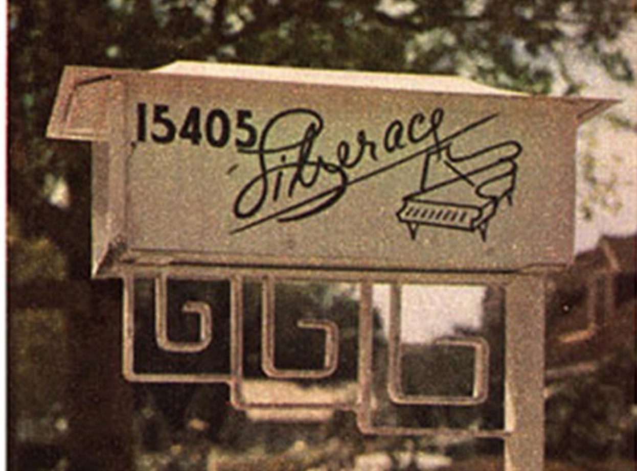
The maestro's flamboyant California mailbox displays his house number, signature, piano