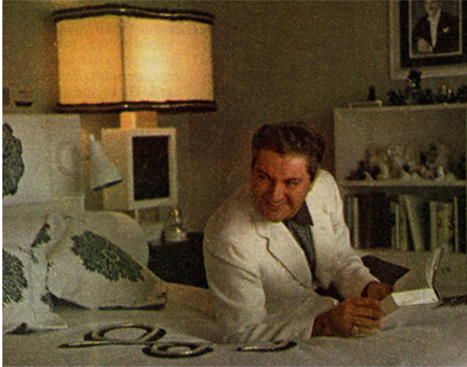
Liberace relaxes in bedroom, surrounded by reminders of himself—like initial on his bedspread and the picture hanging on his wall