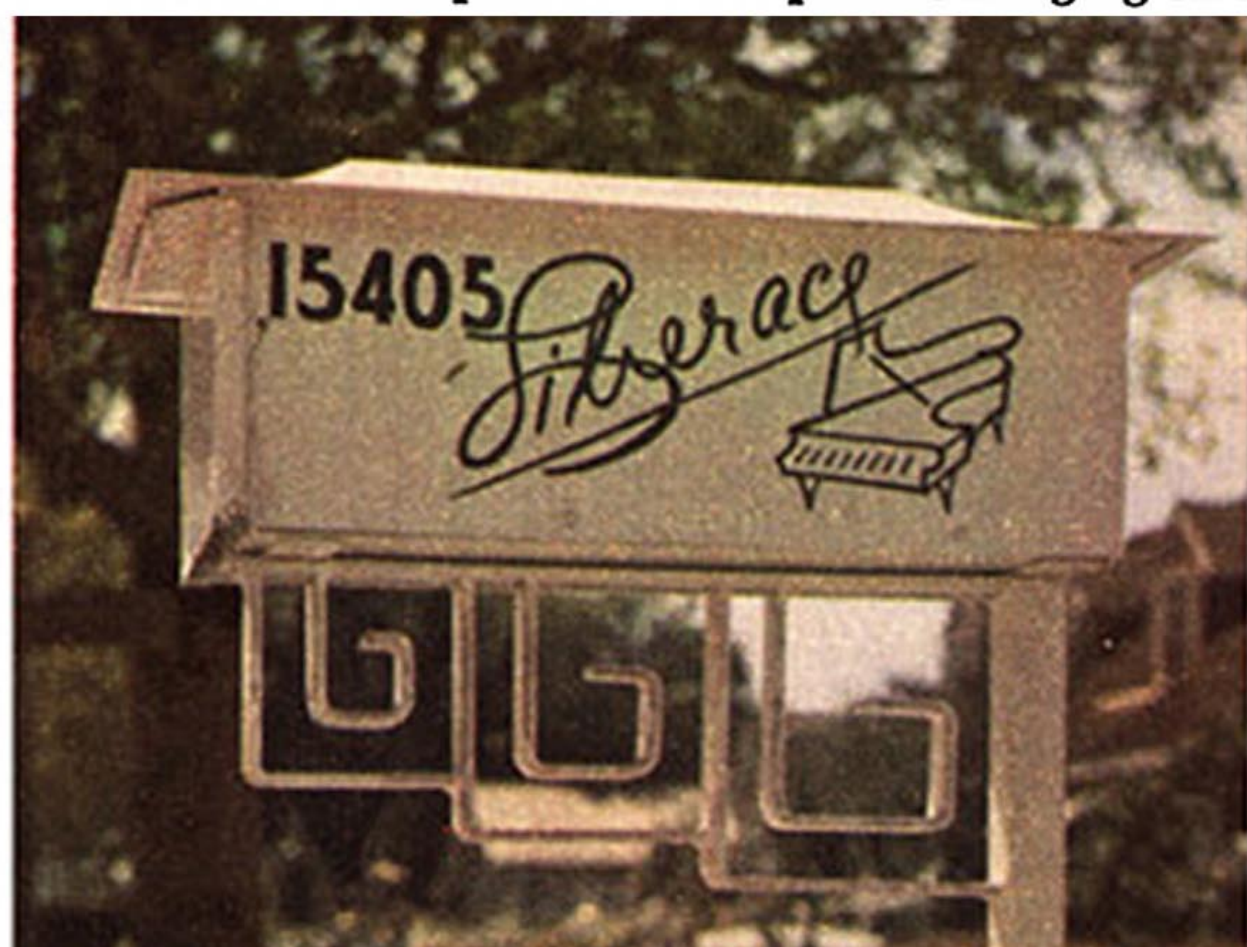
The maestro's flamboyant California mailbox displays his house number, signature, piano