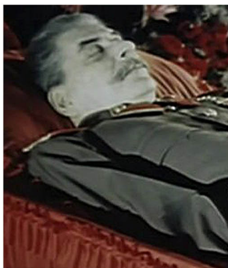
Departed: Russian Premier

Army's choice because the Army thinks it can control him.