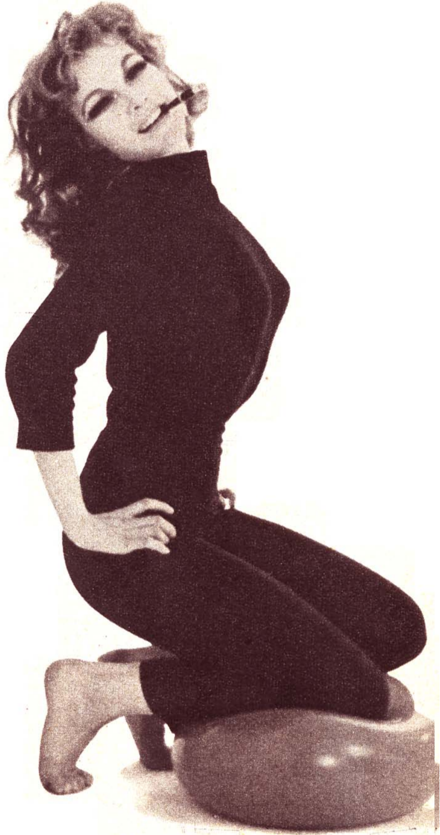
crazy —that which pleases