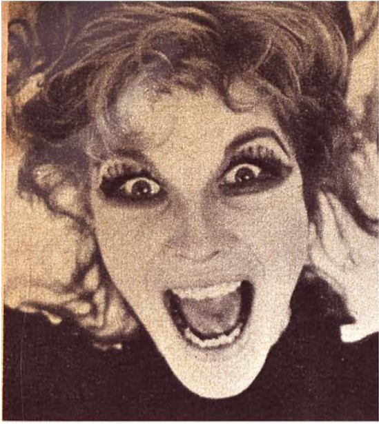
frantic —frenzied, all excited (spiritually or sexually)