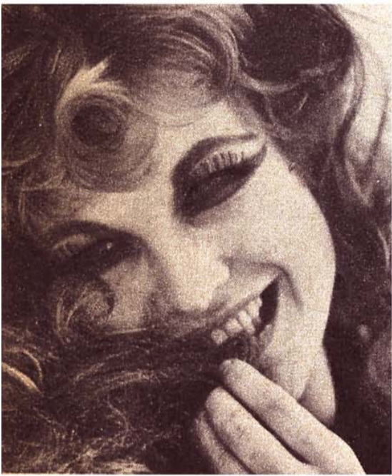
phony-down — an insincere person