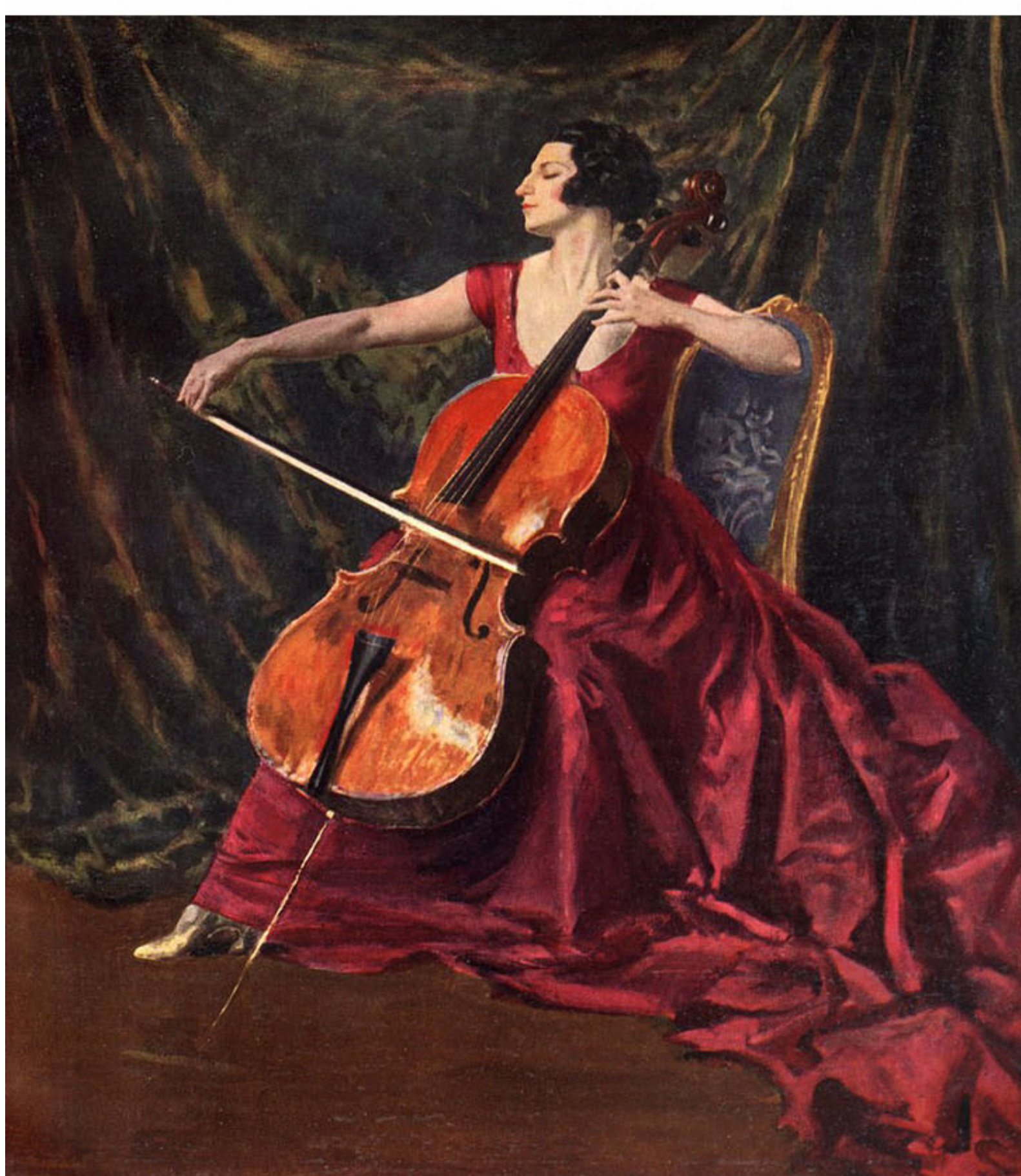
MME. SUGGIA: A PORTRAIT BY AUGUSTUS JOHN

This is one of the fifty-six works by Augustus John exhibited last month at the Alpine Club Gallery, in London, where John achieved the greatest success in his brilliant career