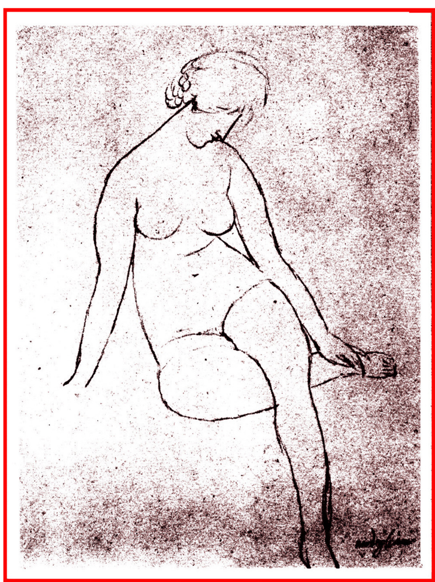
Seated nude, right leg bent under. c. 1917