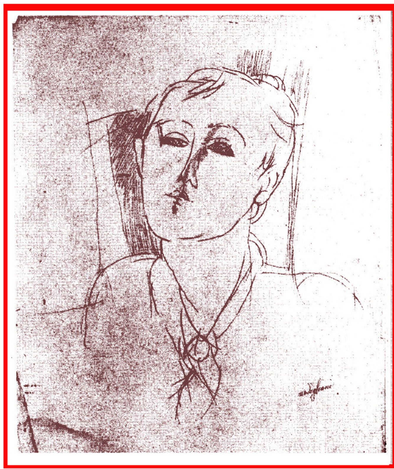
Portrait of a young man. c. 1916

After these explorations in the world of form, line in his drawing was no longer a boundary for colors or planes, but became a language in which newly discovered forms were described. Modigliani's line did not develop calligraphically as did that of Picasso and Matisse. Instead, it developed the strength of steel and the functionality of girders, defining and supporting the masses of his forms. In this, which gives force and character to Modigliani's delicacy and refinement, lies a magic which has proved irresistible to collectors and art lovers of our time. ●