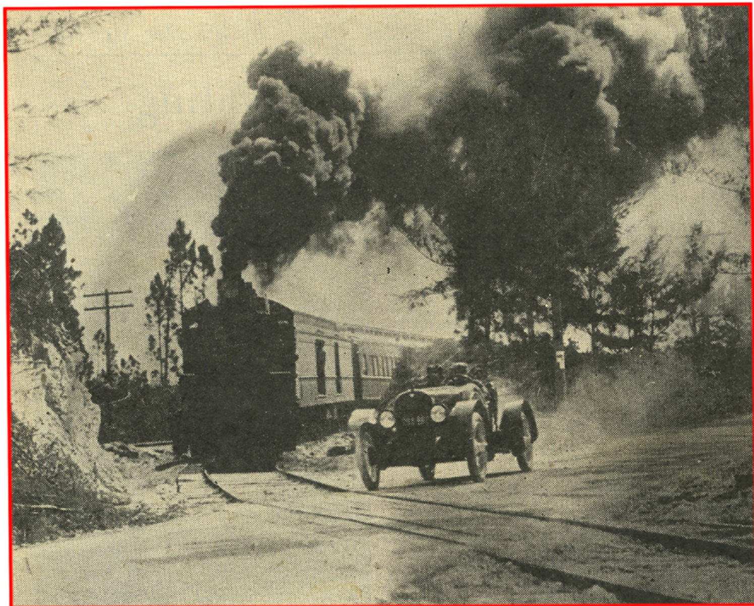
Bureau of Public Roads

Early hot-rodder. Harebrained stunts the 1900s—just as today.