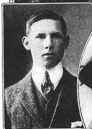
Crown Prince George of Greece