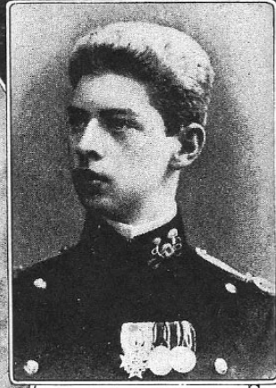
Crown Prince Charles of Roumania