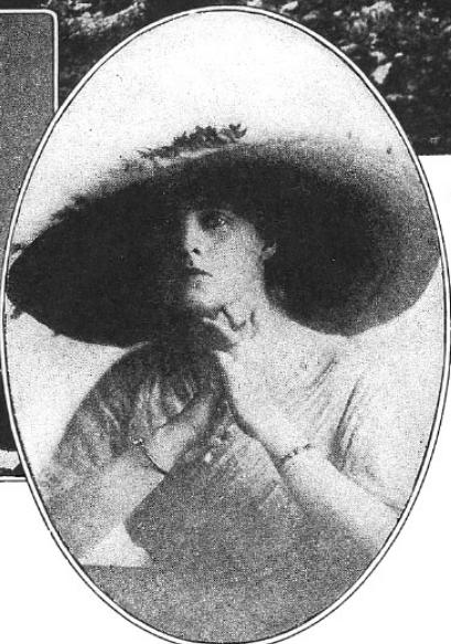
Princess Elizabeth of Roumania