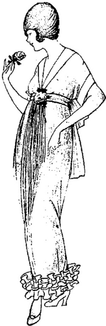
A Cheruit dance frock of blue satin trimmed in rose satin. The fulness of the skirt is placed in small plaits, both in the front and at the back of the skirt. The sash, at the back, is of blue tulle

The dress was severe, but its charm was not so much due to the model, as to the lovely coloring, the blue, which was again repeated in both her stockings and slippers.