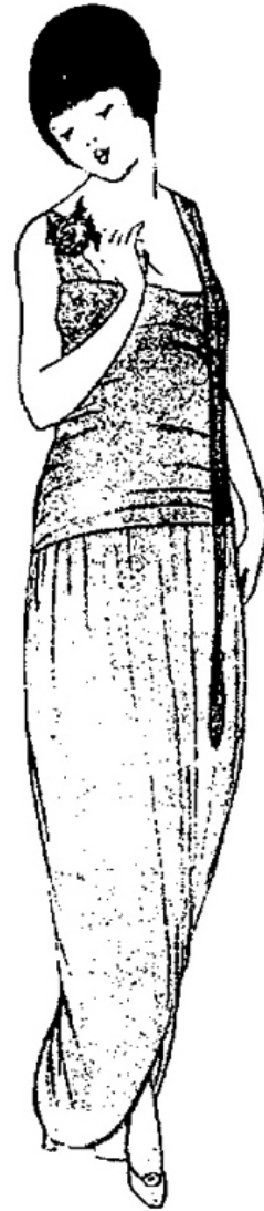
This frock of all blue chiffon is quite sleeveless, and is held on the shoulders with jeweled straps of chiffon. The bodice is nothing more than an elongated girdle. Floating lengths of lavender chiffon fall from the left shoulder