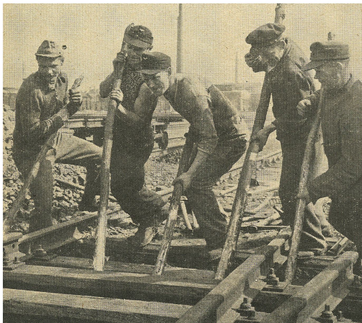
Heave-Ho. German workers repair rails,