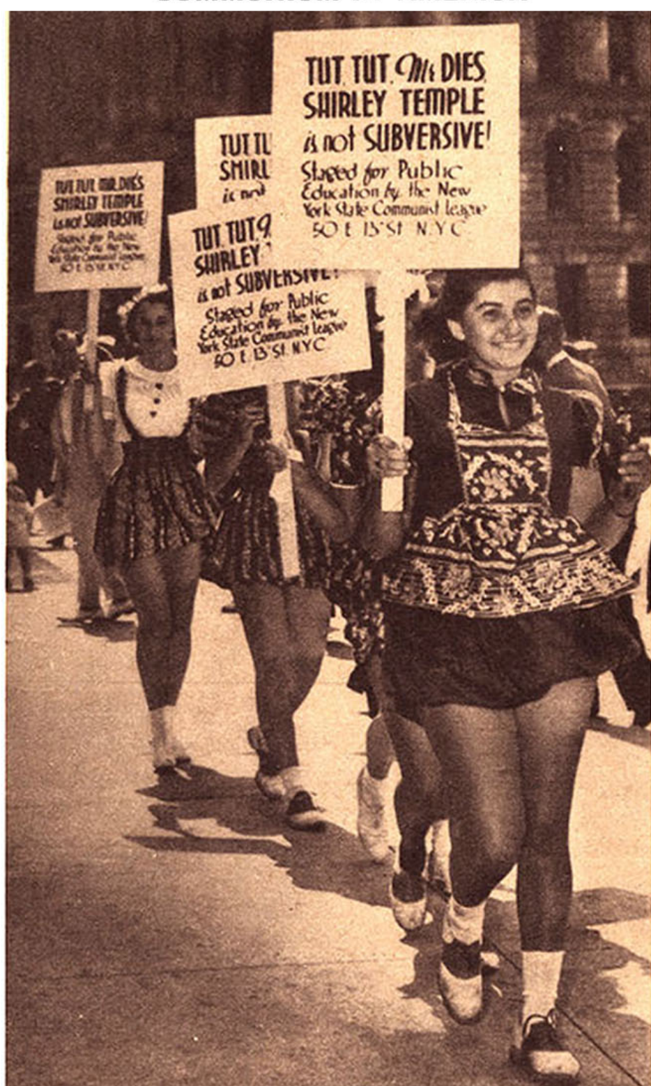
COMMUNIST cuties carry signs which ridicule a Congressional Committee's blunder. The Reds' new "publicity" methods overrule old-time displays of violence.