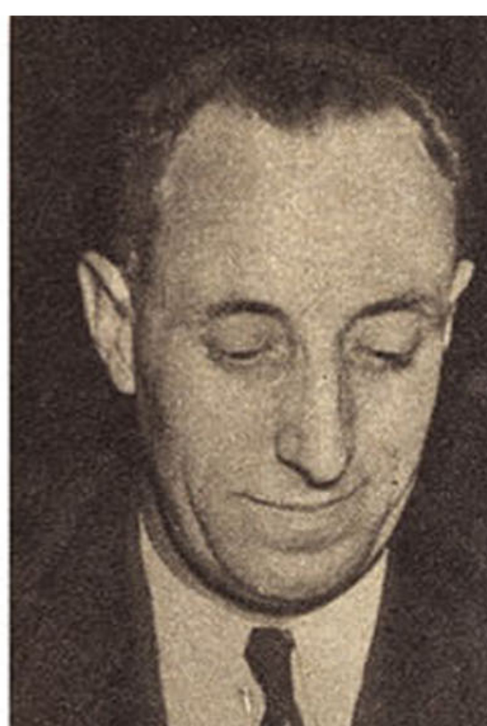
DENYING Communist ties, Harry Bridges and other agitators use Red tactics.