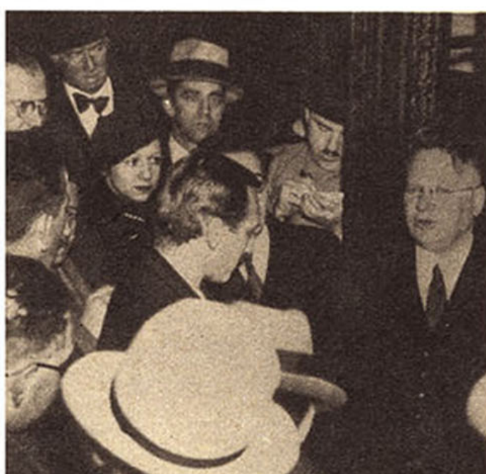
IN 1933 , via Maxim Litvinoff, Russia promised to quash U. S. Reds. The pledges never were fulfilled.