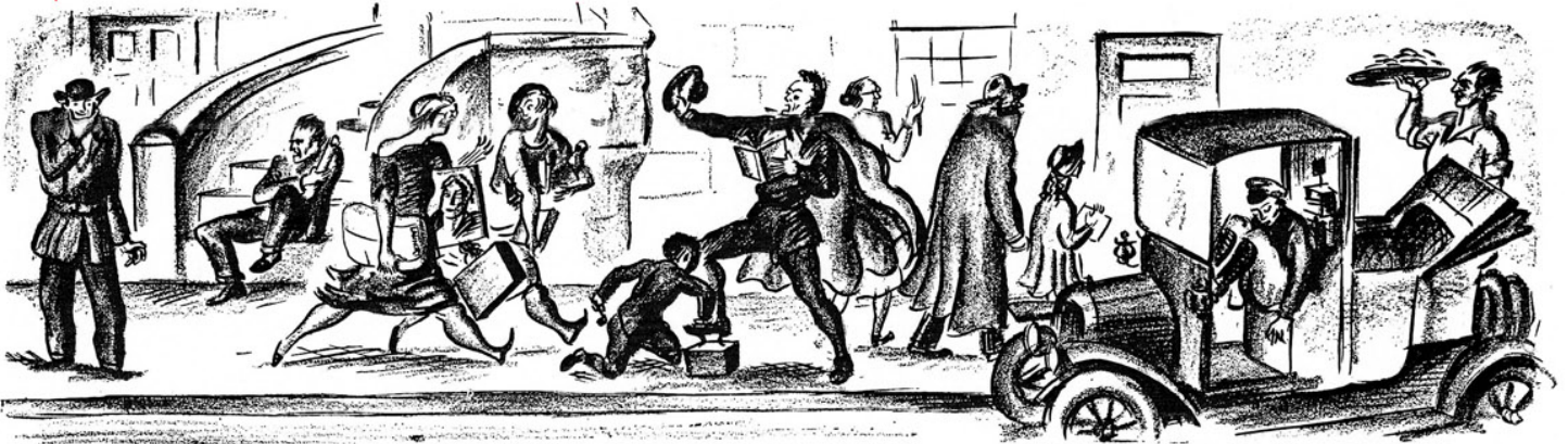
FIFTH AVENUE AT EIGHTH STREET, THE DISTRICT OF BATIKS, ART STUDENTS, TEA-ROOMS, AND FREE VERSE POETS

The thing which makes Fifth Avenue so extraordinary among the famous streets of the world is that it presents a new aspect every half mile or so. Where the Rue de la Paix and Piccadilly preserve their identity throughout, Fifth Avenue shows almost every phase of New York life within a few miles