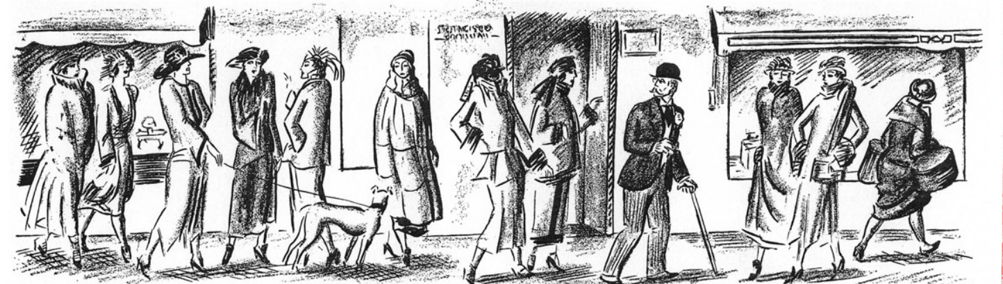
FIFTH AVENUE AT FORTY-EIGHTH STREET, WHICH IS THE HAUNT OF THE MILLINERS AND MIDINETTES