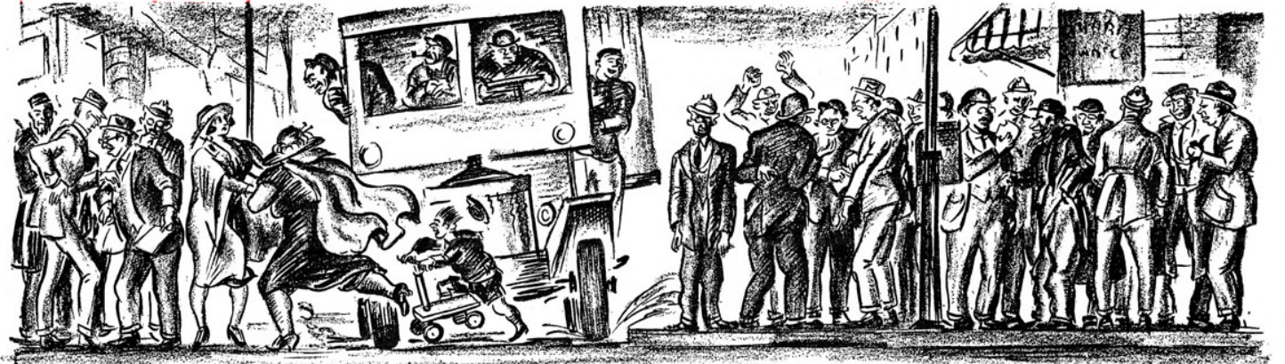
FIFTH AVENUE AT TWENTY-EIGHTH STREET, WHERE THE GARMENT WORKERS, BOLSHEVISTS AND SWEAT-SHOPS ARE FOUND