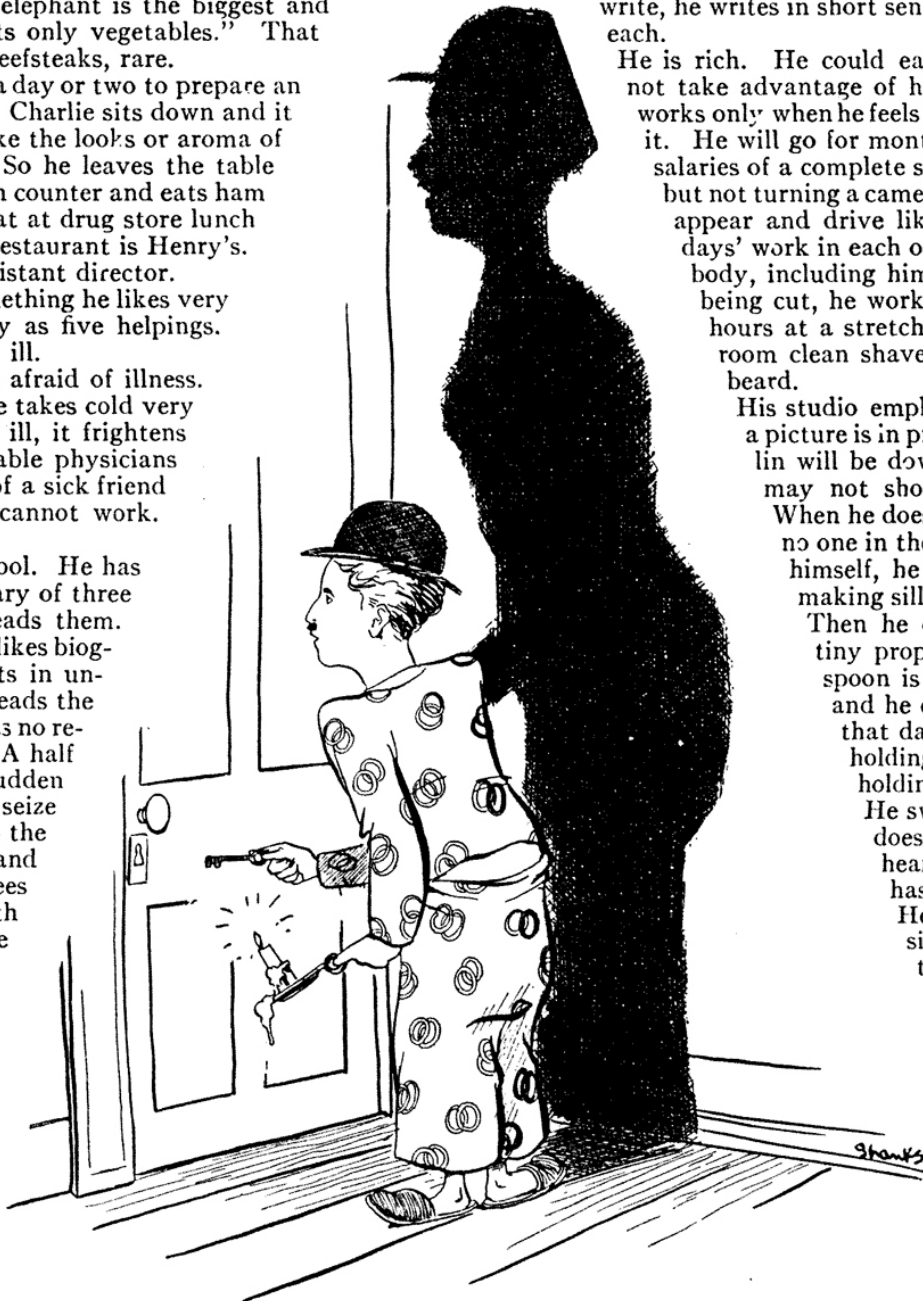
Chaplin locks every door of his bedroom each night before turning in. We do not know for sure whether he sleeps in his derby

He has a dictaphone beside his bed. Two or three times a night, he wakes up and shouts thoughts into the machine. Then he turns it off and goes back to sleep. The next day, secretaries transcribe what he has said, and very often Chaplin doesn't know what it's all about when he reads it. Mostly, from his bed, he