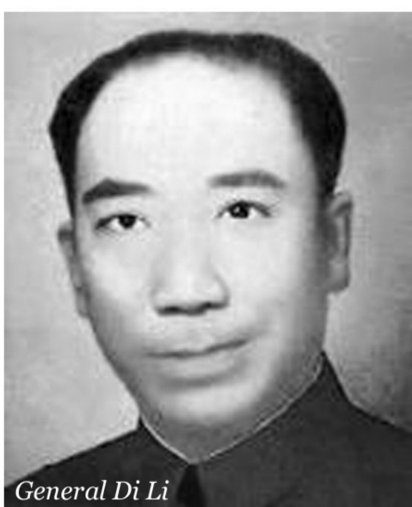
General Di Li