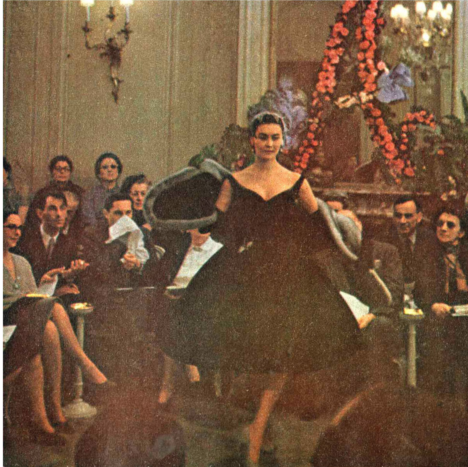
The show. Seats cost up to $1,000, credited against purchases. Name of this gown: Accroche Coeur

life. He is charged with unintentionally worsening relations between the sexes. More and more, as his fashion designs are copied all the way down the international garment line to the mass-produced $3.95 house dresses, he causes thousands of women to rush out and buy new clothes, thus aggravating thousands of men. "Without question," says a rival Paris dressmaker, "dear Christian is the outstanding agent provocateur of domestic schisms. No other world leader can make that claim."