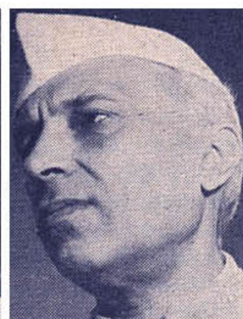
"Honest men" of Asia: Mossadegh, Soekarno, Nehru (l. to r.)