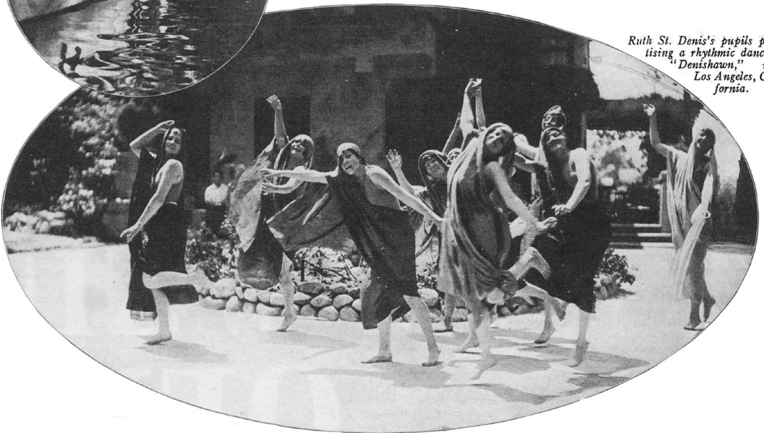
Ruth St. Denis's pupils practicing a rhythmic dance at "Denishawn," near Los Angeles, California.

the past, Miss St. Denis has recently shown her visitors a new and bizarre creation—a series of modern aquatic dances. In all her work at Denishawn, Miss St. Denis aims rather at developing the spirit of personality in dancing, than mere mechanical perfection. Miss St. Denis' pupils are not all preparing for the professional stage; many of them are amateurs who have only taken up dancing because they love it, or know the value of its influence.