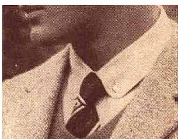
The new university collar?

COLLEGE MEN'S COLLARS were expected to sell short—like the Van Heusen button-down with new, short rounded points ( top ).