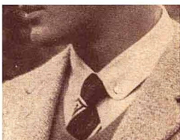
The new university collar?

COLLEGE MEN'S COLLARS were expected to sell short—like the Van Heusen button-down with new, short rounded points ( top ).