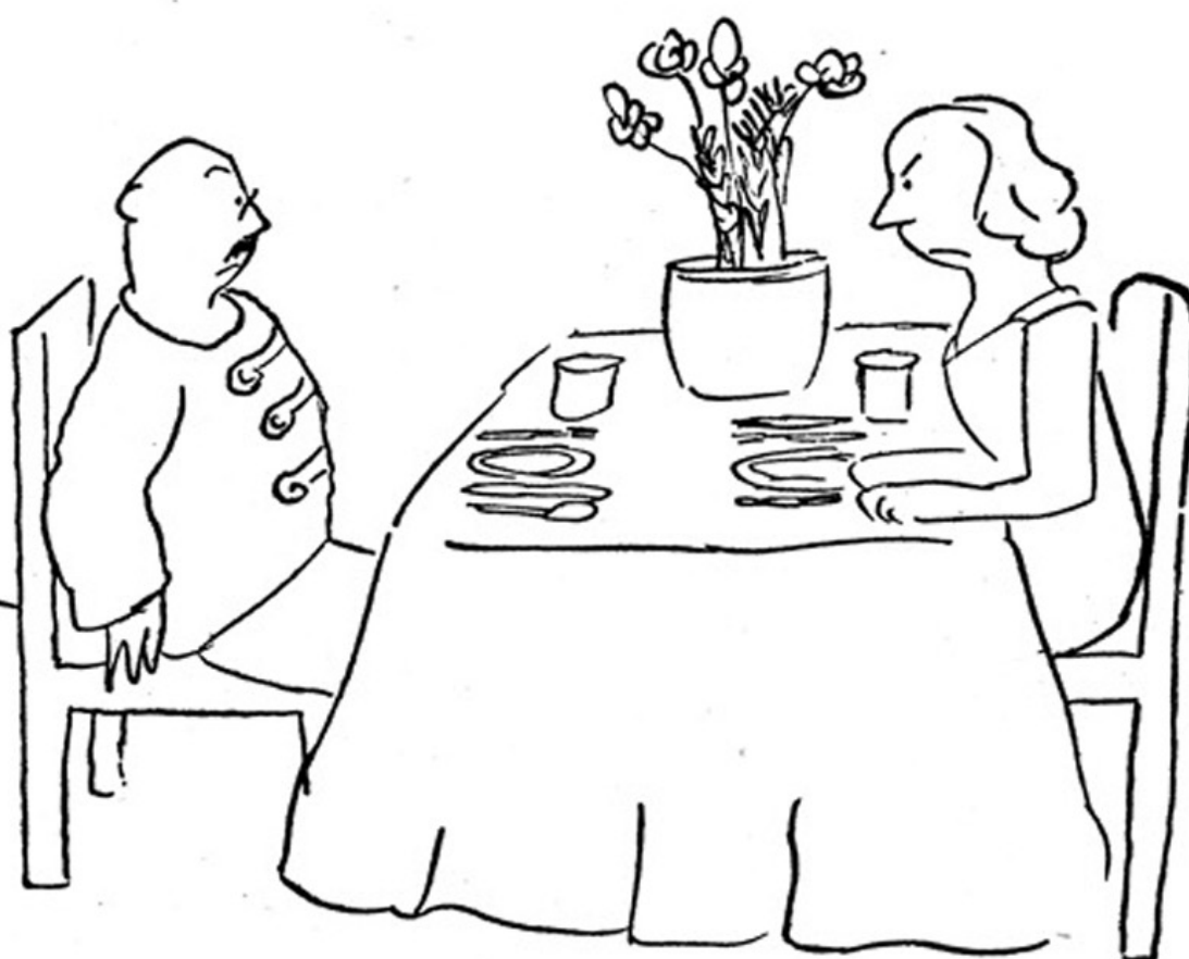
NEVER IN MY HOME!