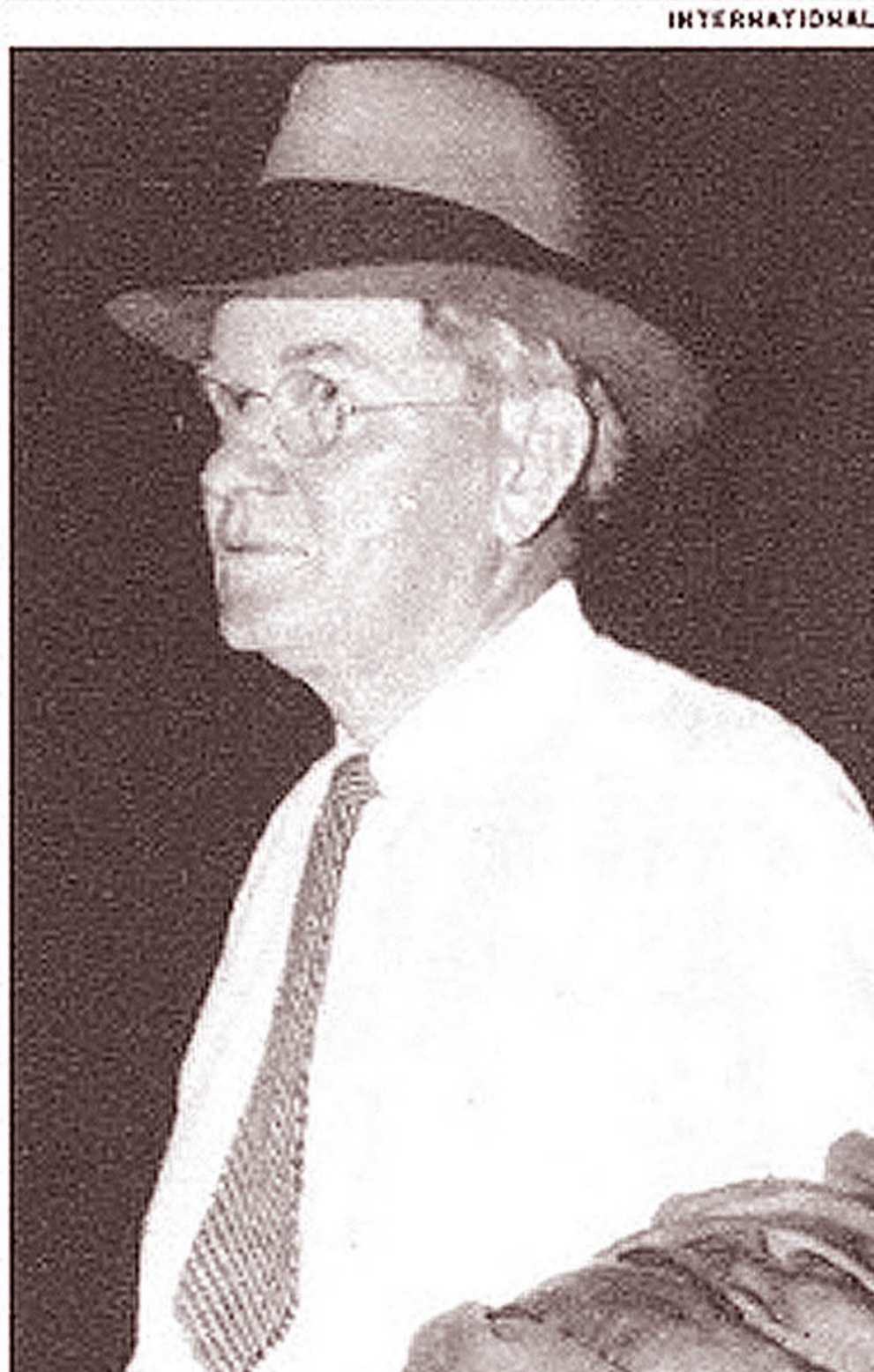
"For a dead hand was being laid on this whole program of progress - to stay it all. It was the hand of the Supreme Court of the United States." Pictured Above are former justices McReynolds, Van Devanter and Butler, whose judgements were constantly against the New Deal measures.

decent prices for their crops and a fair share of the national income; to save stituted action for indecision and negation. It had extended comprehensive assistance to all sections and all groups of its citizens, instead of merely restricting its financial favors and economic advantages to the few at the top of the ladder, hoping that they might trickle down to the many at the bottom.