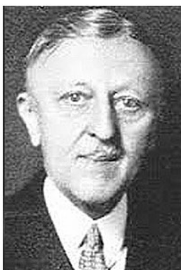
WILLIAM H. WOODIN of New York. Secretary of the Treasury.

"Mr. Roosevelt has immense political astuteness. Putting his opportunity and his character together, this writer estimates and surmises as follows: The country and the Congress do not want Mr. Roosevelt as President to query. They want him to command. He therefore will."